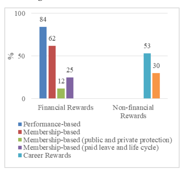
Figure 1. Financial and Non-financial Rewards Percentage

The results obtained from the reward variable for athletes and coaches (n = 55) illustrated factual scores or the total value of 860, while the ideal score or the maximum number of values was 1650. Therefore, the overall average score was 0.52, then the percentage of rewards given to athletes and coaches was 52%, which means "good enough." Furthermore, the data were described based on indicators starting from intrinsic rewards. Intrinsic reward indicators that include interesting work, responsibility, recognition, achievement, task variety, and task significance got a percentage value of 98%, which means "outstanding." On the other hand,