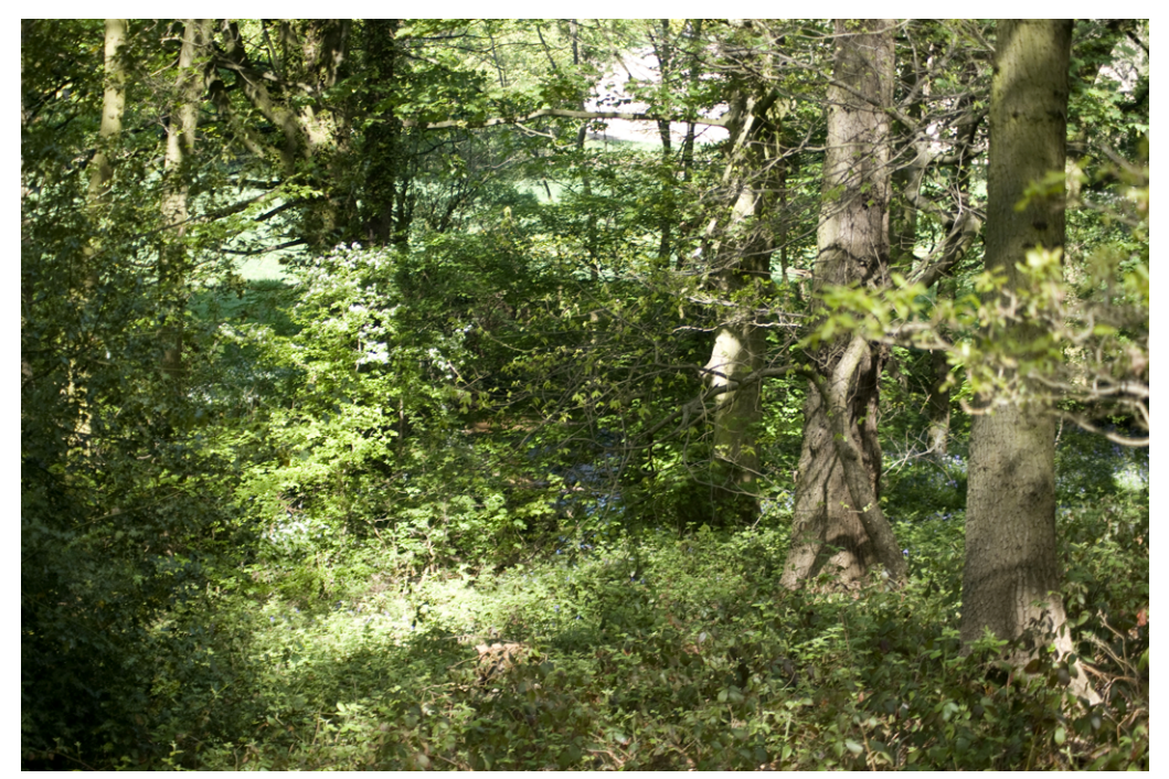
Figure 7: Spatial layers: woodland near Silkstone.

Figure 7 was taken in woodland seen in the left background of Figure 6. The sensations we can experience in woodland like this include an element of timelessness. 'Natural History' being seasonal and cyclical lacks the chronological reference points of documents, artefacts or architecture. This is an eternal present through which William Basforth walked and we in our turn. It is also an eternal past and can be seen similarly in Figure 8.