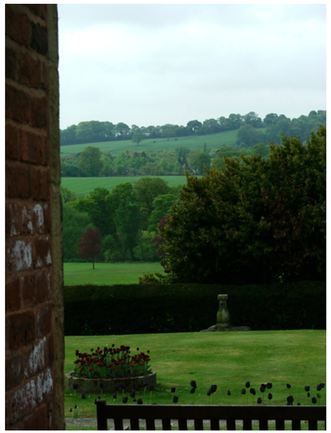
Figure 4: Park landscape, once private, now public enjoyment

having been a marker. According to Steve Healey, who maintains the church grounds and prepares new graves, the land on the north side of