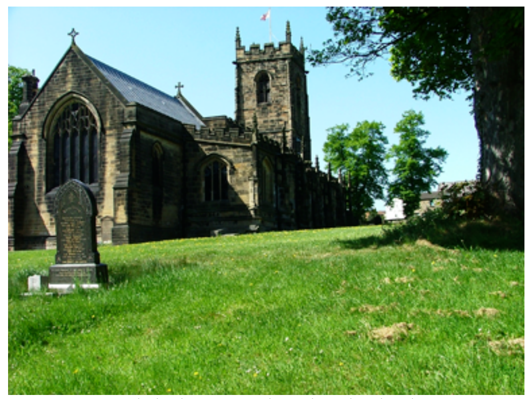
Figure 5: Silkstone Parish Church from Dodworth lane, the north on the right (Martin Bashforth)

the church that previously contained the older burials has been completely cleared of gravestones and lies fallow for the planting of future generations of parishioners, though as he digs new graves he may disinter older burials.<sup>18</sup> (See Figure 5.) In terms of material culture, we are left with one bottle, now an exhibit at the Victoria Jubilee Museum in Cawthorne and identified as a seventeenth-century product of the glassworks at Silkstone.<sup>19</sup> This single artefact is the sole material link to William's crime, but only by association.