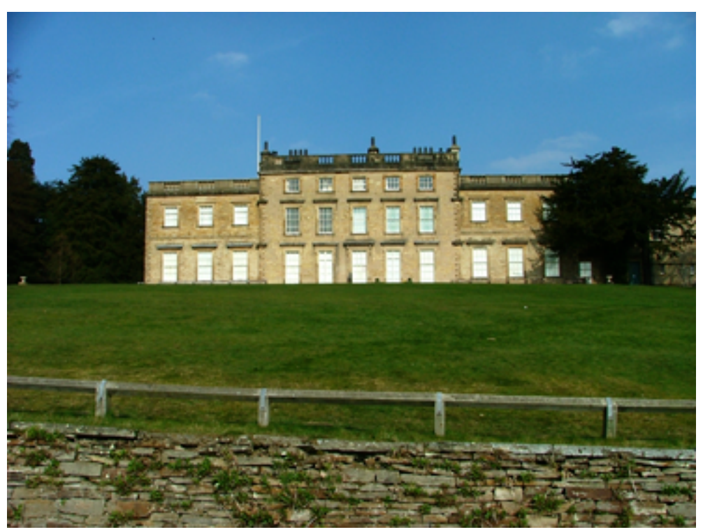
Figure 2: Cannon Hall in 2011 (Martin Bashforth)

Public History Review | Bashforth & Bashforth