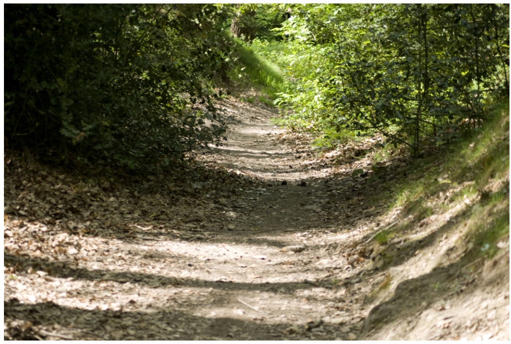
Figure 8: Woodland path near Silkstone

Public History Review | Bashforth & Bashforth