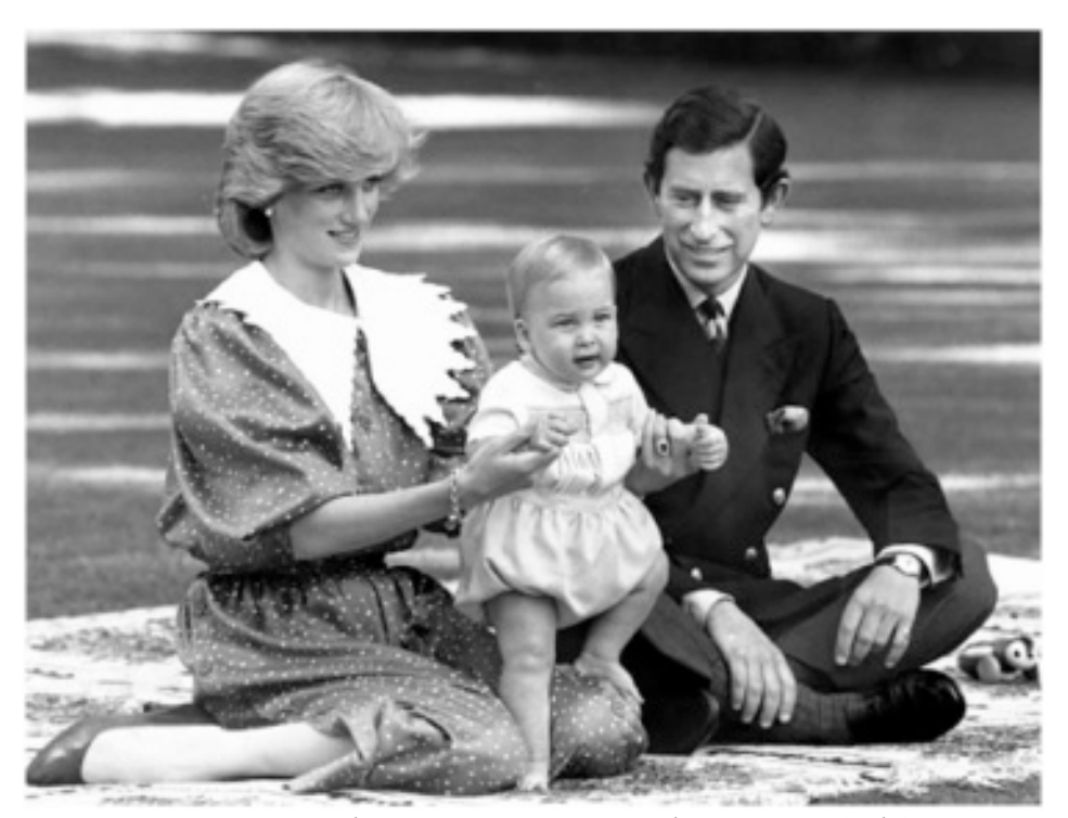
Figure 4 Prince William and his parents in Auckland with a Buzzy Bee (right), 1983

elements that I. Woodward consequently encapsulates by suggesting that: