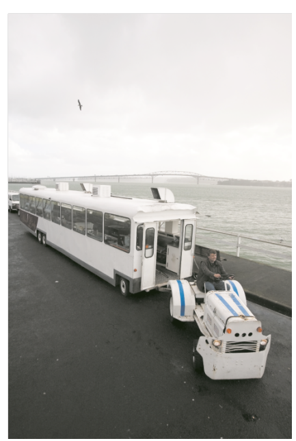
Figure 1 The White Lady<sup>3</sup>

D. McGill defines pie carts as 'caravan(s) with a [top-]hinged side door through which fast foods are dispensed, [most notably] pie pea and pud,<sup>4</sup> mince pie with mashed potato and peas sloshed over with gravy'.<sup>5</sup> Eastern Southland Museum curator J. Geddes suggests that the caravan form of the pie cart was influenced by the rural 'stinker'.<sup>6</sup> These were straight-sided horse-drawn wagons covered by an arched roof. 'Stinkers' were used by farm and field workers as rest huts, gaining their