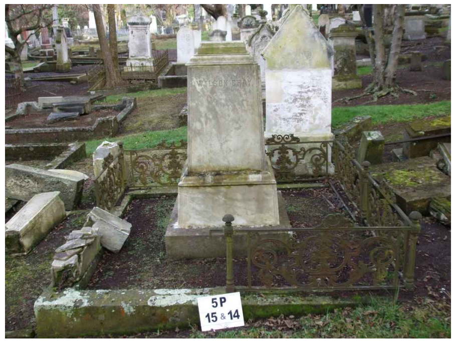
Figure 4 The present state of the grave of Moses Wilson Gray, a district judge of the Otago goldfields and formerly a member of the Legislative Assembly of Victoria, where he was a prominent land reform campaigner. He died at Lawrence in Central Otago but was buried in the Southern Cemetery in 1875. Dunedin City Council, Cemeteries Search:

http://www.dunedin.govt.nz/facilities/cemeteries/cemeteries_search