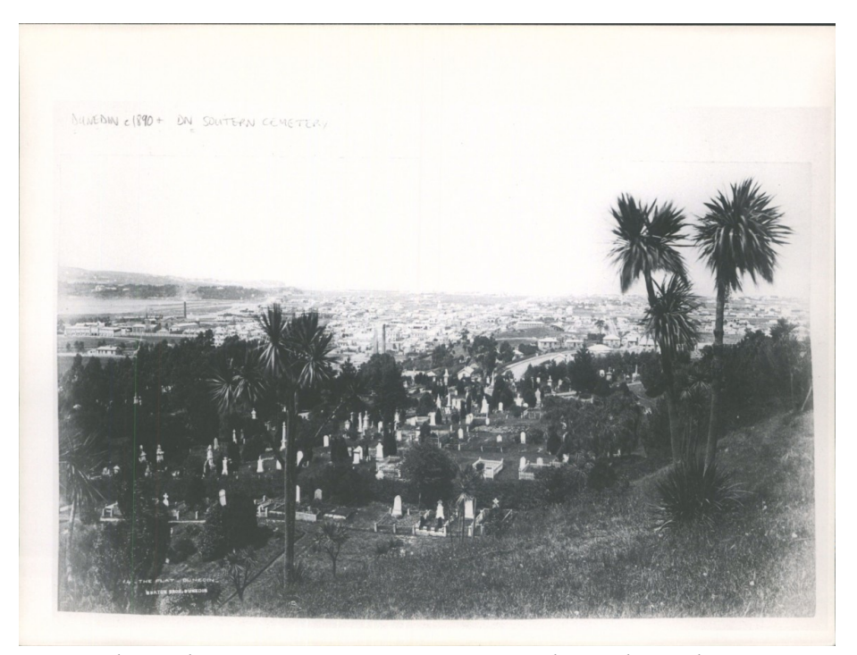
Figure 3 The Southern Cemetery, Dunedin, looking south over the South Dunedin suburbs towards the sea, cabbage trees in the foreground, c.1890. Hocken Collections/Uare Taoka o Hakena, Otago University, Dunedin, c/n 2815/29, Burton Brothers, 'The Flat–Dunedin'

from the north across open ground covered with what appear to be daisies.<sup>112</sup> This shows that by about 1880 the cemetery was hedged along its upper, Eglinton Road boundary<sup>113</sup> in addition to the hedge that surrounded the Anglican section. Several trees were by this stage mature, and there were, naturally, many more monuments. The wooden fences evident in the earlier view were now gone. This is confirmed by a photograph of about ten years later, in which several iron railings can be seen. By this time, several large cabbage trees had grown which were not to be seen in the earlier views, though they may not have been deliberate plantings.<sup>114</sup>