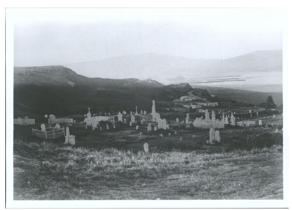
Figure 1 The Southern Cemetery, Dunedin, looking north towards the city, the jetties and wharves projecting into the inner harbour, c.1868. The main south road rounds the corner of the rocky outcrop in the middle distance. The hedged enclosure is the Church of England cemetery. Hocken Collections / Uare Taoka o Hakena, Otago University, Dunedin, c/n E6824/38, J. Tensfield, 'Dunedin from the South, Cemetery'

to be buried in the Southern Cemetery on the site of their cottage under what had been the hearthstone.<sup>75</sup> Despite the expansion of the city and the reclamation of the head of the harbour, the view remains relatively unspoiled and since the main route to the south no longer follows South Road, the cemetery is relatively undisturbed by the noise of passing traffic.<sup>76</sup> Although the cemetery was visible from the main approach to Dunedin from the south, the hillside to the cemetery's north means that it could not easily be seen in its entirety from the main part of the settlement itself. This differs from many similar cemeteries in Britain which were set on hillsides partly in order that they could be seen from the cities they served.