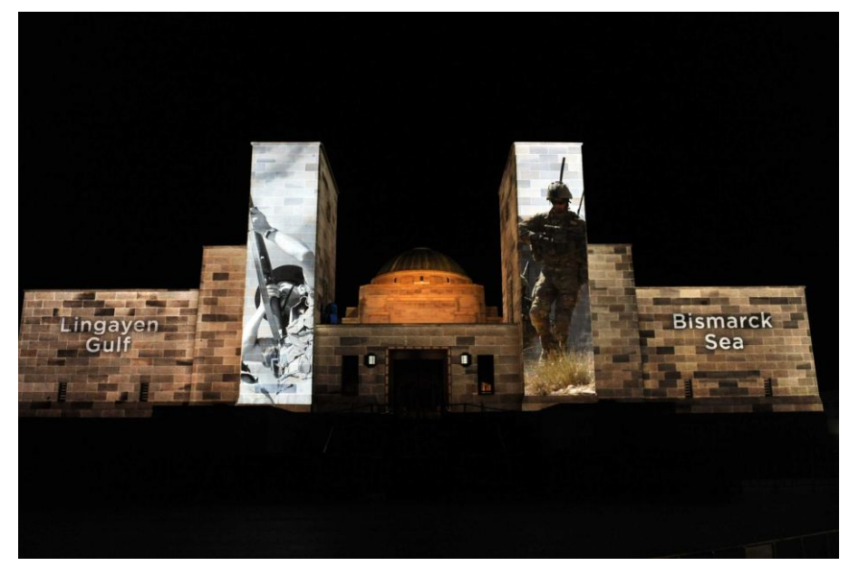
Anzac Day Dawn Service, Canberra, 2013

Australian troops waiting to be evacuated by helicopter was etched into the polished granite wall of the Vietnam Memorial of 1992, many other memorials such as the Australian Services Nurses National Memorial (1999), the Royal Australian Air Force Memorial (2002), and Reconciliation Place (2001), have followed its lead in reproducing the momentary slice of time of the photograph within various ageless, either vitreous or lithic, surfaces. In these memorials the sharp shards of the photographically specific adds piquancy to the generic mise en scene of the nationally commemorative.