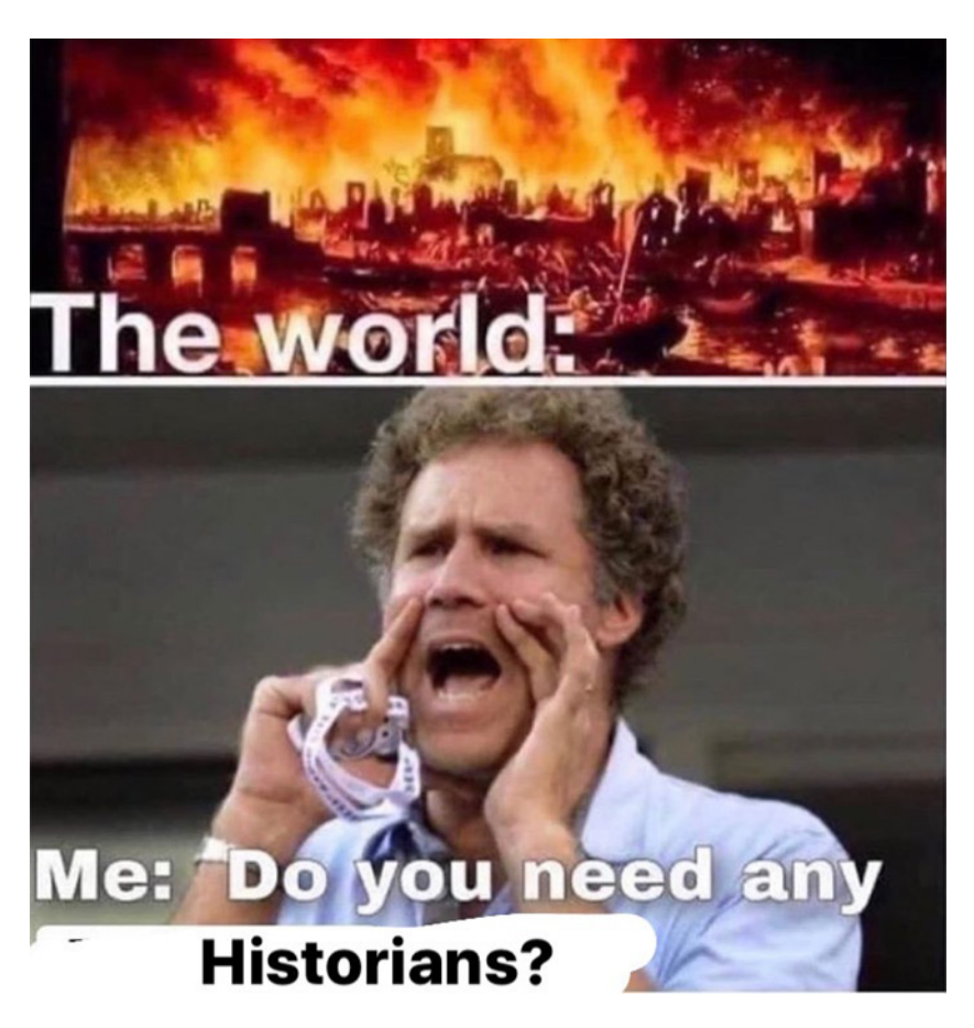
Fig 2 Instagram meme. Sourced 11 September 2020.

MF I want to move us from 'citizen archivists' – as Carolyn has called these everyday people contributing to the archive – to historians. If we're looking at an archive that's being created by everyday people what is the role of historians? I think this meme encapsulates the issue (see figure 2). What can historians do in this moment of catastrophe? What can we bring to the table? What's our unique contribution to this moment?