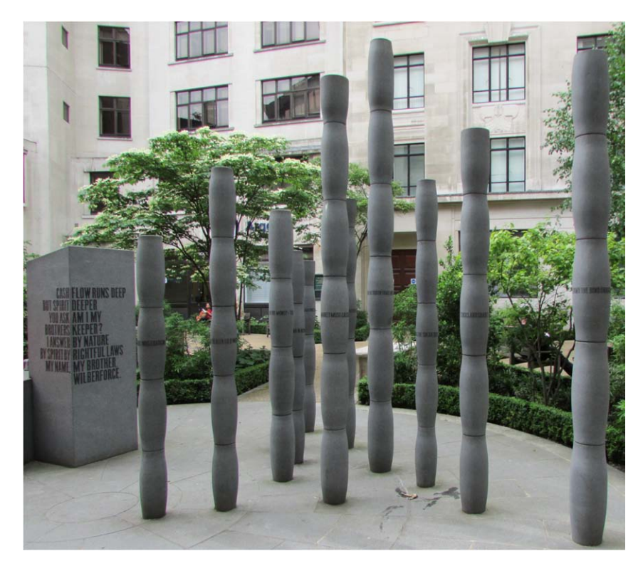
Gilt of Cain by Michael Visocchi (with Lemn Sissay), City of London, 2008

'The Gilt of Cain' combines material of the Scottish sculptor Michael Visocchi with Lemn Sissay's poetry and was opened in 2008 by Desmond Tutu. Visually, the sculpture consists of variously sized cylindrical columns, resembling sugarcane – or possibly human figures.