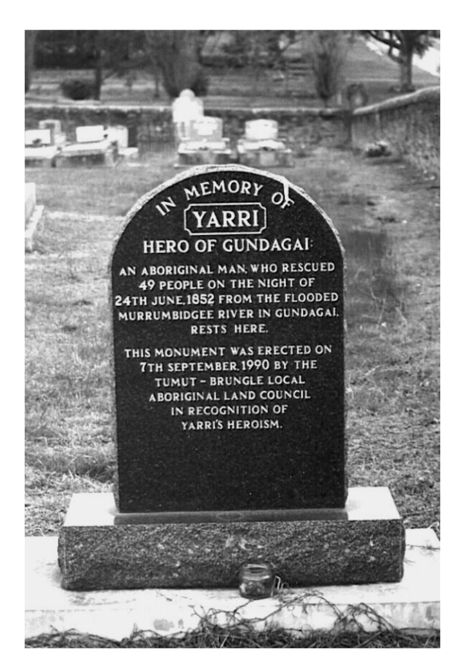
Yarri's monument, North Gundagai cemetery, erected 1990

have existed positively for many years. One of the most popular books – apparently widely ignored by many activists in recent events – is Peter Fryer's Staying Power: The History of Black People in Britain published by Pluto Press in 1984 and only recently promoted on a particular British Library website. <sup>23</sup> However, specific attention paid in schools to anti-racist historical curriculum had been widely abolished beyond recognition such as that developed by the ILEA alongside radical teachers in ALTARF from 1978 into the 1980s. Their publication Challenging Racism explored the strategies implemented in a range of schools. <sup>24</sup>