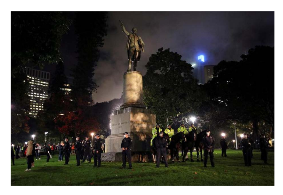
'Police officers stand guard around the statue of British explorer Captain James Cook as they deter demonstrators from taking part in a protest against police brutality and the death in Minneapolis police custody of George Floyd, in solidarity with the Black Lives Matter protests in the United States, in Sydney, Australia, June 12, 2020' : <a href="https://www.reuters.com/article/us-minneapolis-police-protests-australia-idUSKB">https://www.reuters.com/article/us-minneapolis-police-protests-australia-idUSKB</a>

further explosion of outrage which ignites when a policeman allegedly gives one of the protestors a hand signal which the protestors associate with white supremacy.<sup>2</sup>