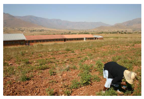
Photograph 4: May 2007