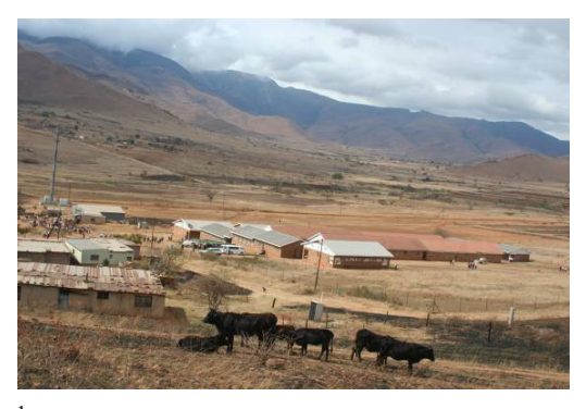
Photographs 1 and 2: Winter 2006 at the secondary school

What we describe in this article is another image that co-exists as reality with the realities referred to above. We present counter-illustrations of how teachers promote resilience in schools to balance numerous