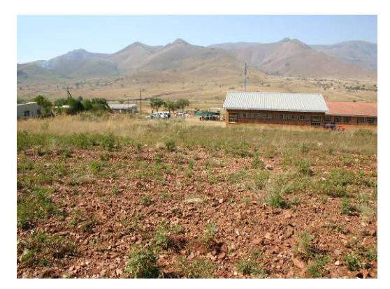
Photograph 5: October 2007