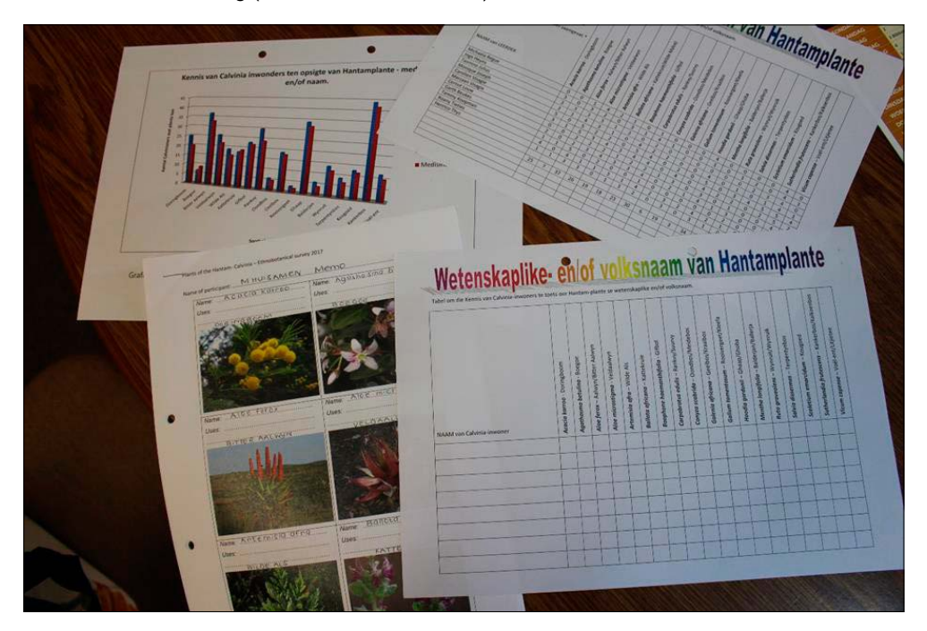
Figure 2: An example of artefacts from a Teachers' portfolio, reflecting on the ethnobotanical survey

During previous cycles in this design-based research (e.g., in Limpopo, North-West Province and Gauteng), on which authors such as De Villiers et al. (2016); De Beer and Petersen (2016); and White and De Beer (2017) have reported, teachers provided very superficial reflections in their portfolios. The researchers came to realize that, given the systemic pressures on teachers (e.g., the full curriculum) many teachers do not make time to reflect on their teaching (Mentz & De Beer, 2019).