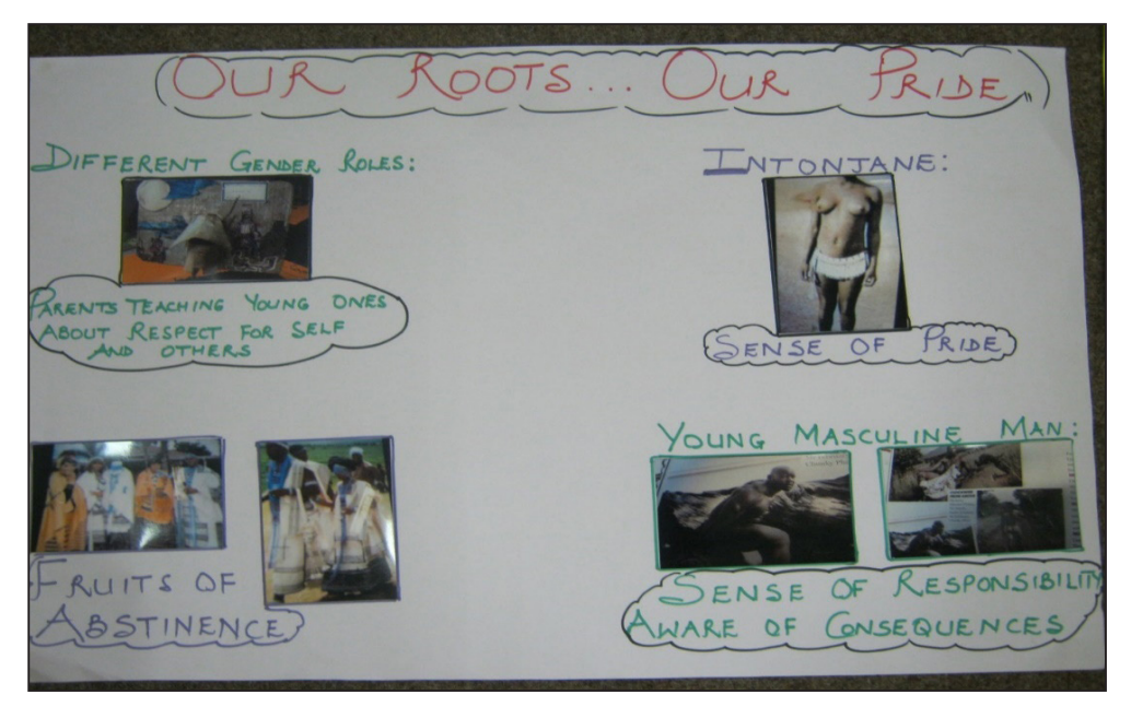
Figure 3: LO subgroup curriculum poster 1, "Our Roots... Our Pride"