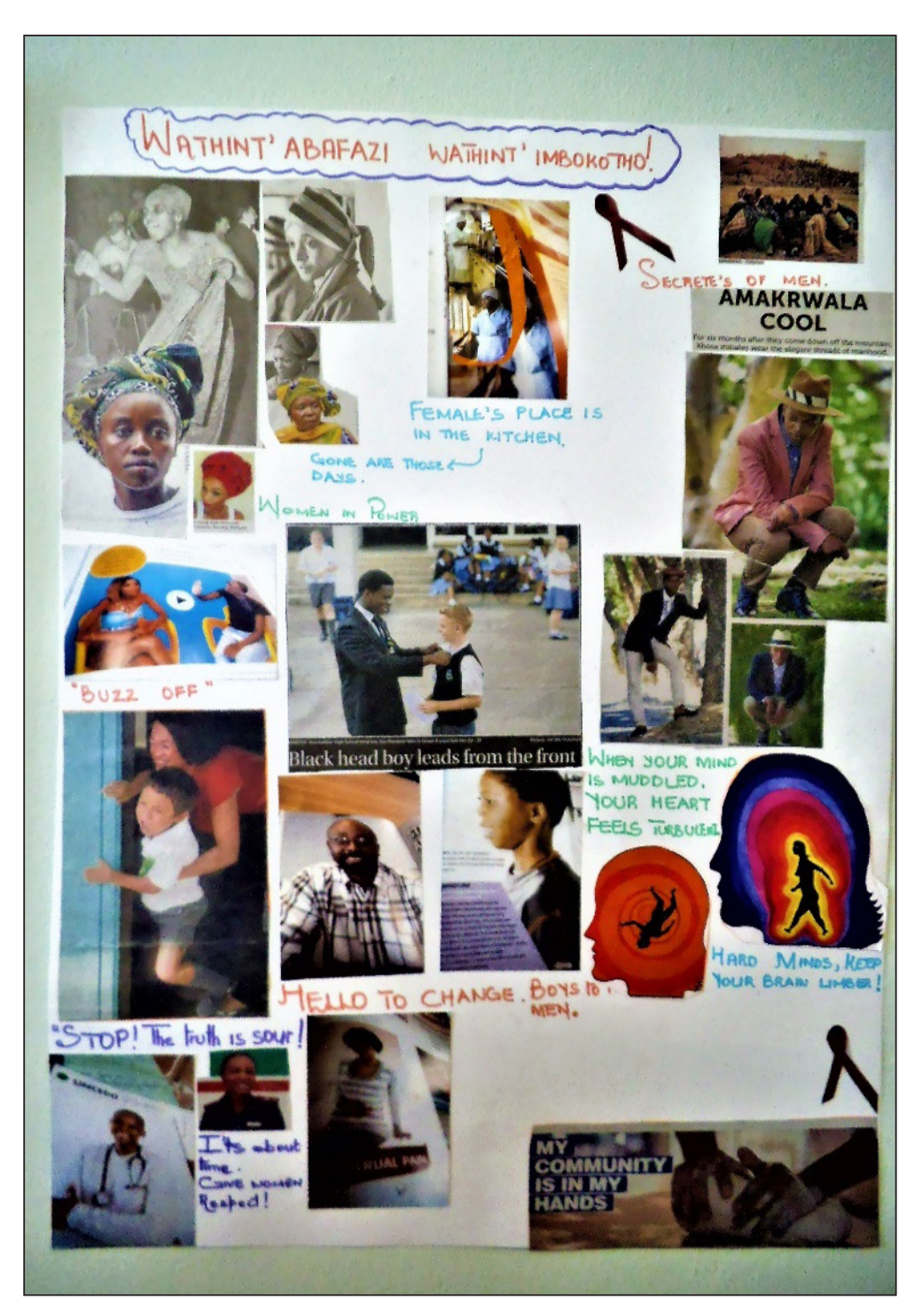
Figure 5: LFSC subgroup curriculum poster: Wathint'abafazi! Wathint'imbokotho! (You strike a woman! You strike a rock!)