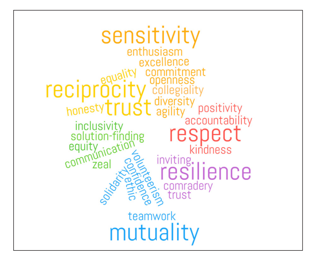
Figure 2: Display of common values

Although the values were listed in response to a particular question posed, they recurrently crystallised in responses to other questions.