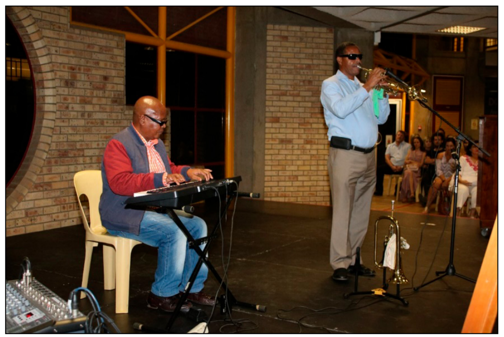
Figure 1: Blind jazz music band, "2 of a kind plus" entertaining the audience at the opening of the exhibition. Available at: https://www.up.ac.za/humanities-education/news/ post_2734033-i-shut-my-eyes-in-order-to-see-annual-art-exhibition