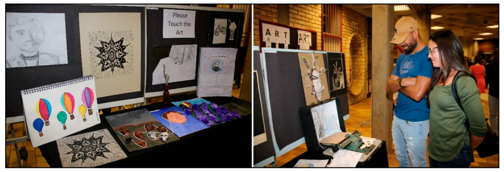
Figure 3: Artworks experienced through other senses. Available at: https://www.up.ac. za/humanities-education/news/post_2734033-i-shut-my-eyes-in-order-to-see-annual-art-exhibition

As for the design students, the element of direct exposure inspired them to enter the risktaking process with greater confidence because they could restructure their previous works using a different line of thinking and create artworks that were experienced and appreciated through other senses in a public exhibition (Figure 3).