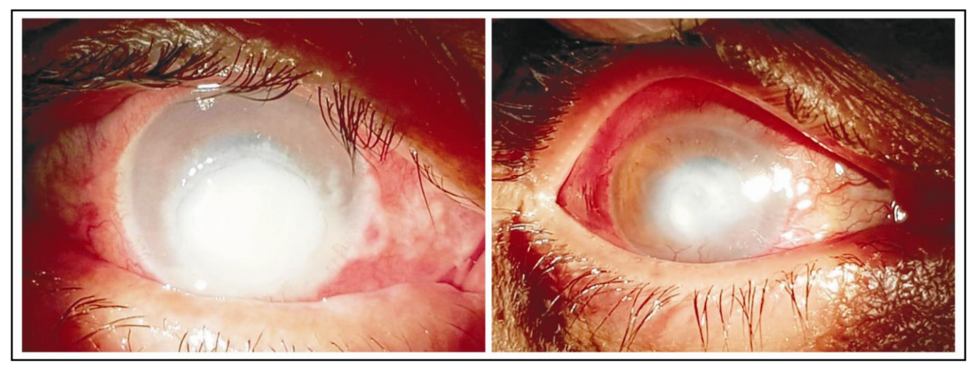
Fig. 1: Corneal Ulcer Before (Left) and After Treatment (Right).

Sixty four patients were selected, fifty five were males and nine were females. Mean age was 32 \pm 8 years and age range was 18 to 60 years. Corneal scrapings were sent to lab for 10% KOH staining. Only 37% showed positive staining and 63% were negative. Fifty six patients (88%) responded well (47 males and 8