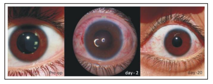
Fig. 3: Subluxated lens before surgery. Anterior segment on post-operation day 2 and day 20.