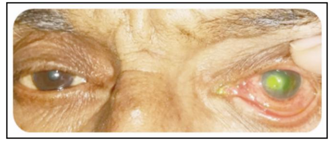
Fig. 5: Pre-operative Left Corneal Epithelial Defect.