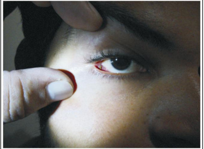
Figure 3: Insect in Inferior Fornix.

On an average 2.18 patients with ocular surface foreign bodies presented per day. Ocular injury with ocular surface foreign bodies was more common in males than females. Male to female ratio was 2.5:1. This is in close approximation to that presented by Reddy et al ^8 . Males are at greater risk to trauma due to their exposure in occupation, travelling and assaults ^9 . Mean age in our study was 38.58 \pm 21.49 years. Jahangir T and co-authors reported mean age of 28.6 \pm 17.6 years ^{10} . In another study the mean