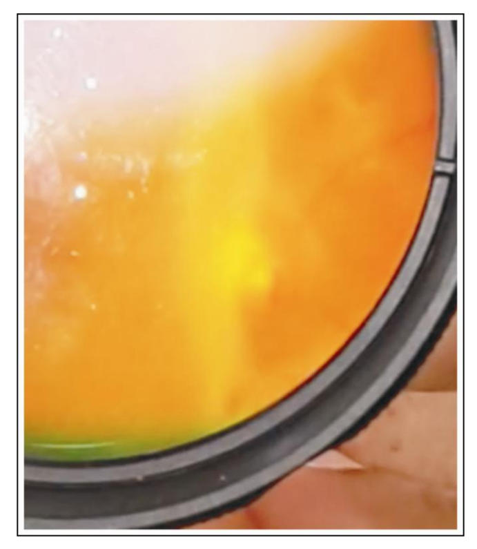
Fig. 3: Fibrous tractional fold at disc and macula along with neo vascularization at disc.