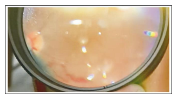
Fig. 4: In a silicone oil filled eye there is neo vascularization at disc and neo vascularization elsewhere.