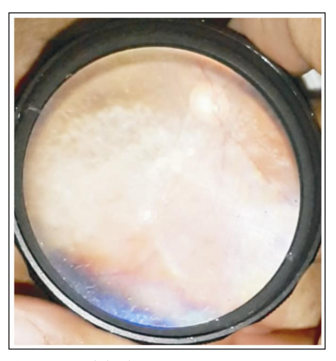
Fig. 6: Asteroids hyalosis.