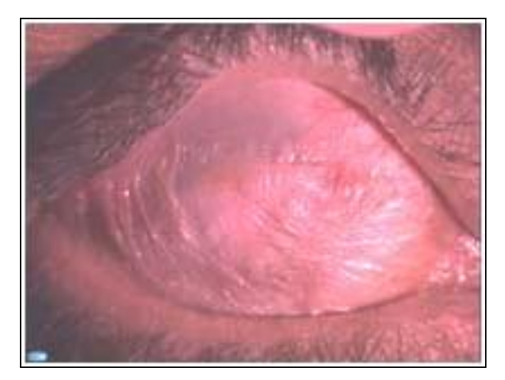
Fig. 1: Severe dry ocular surface in Steven Johnson Syndrome.

pertaining to the use of Boston KPro in eyes with BBI. However, Harissic- Dagher and Dohlman in their paper "The Boston keratoprosthesis in severe ocular trauma" mentioned 6 cases of mechanical trauma out of their total 30 studied cases. In their research anatomic success was achieved in 5 out of 6 mechanically traumatized eyes<sup>6</sup>.