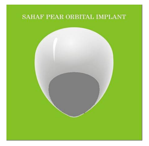
Fig. 2: Implant view from bottom