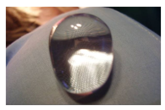
Fig. 1: Implant view from above