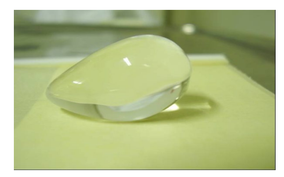
Fig. 3: Implant view from side