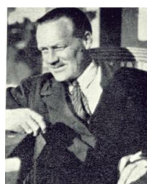
See next issue for answer.