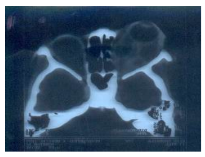
Fig. 2: Axial view – showing multiple intraconal cystic lesions