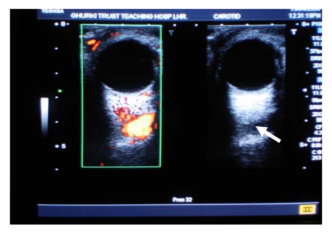
Fig. 4: Doppler ultrasound of right orbit. Red arrow shows turbulence in right superior ophthalmic vein. White arrow pointing towards dilated right superior ophthalmic vein.