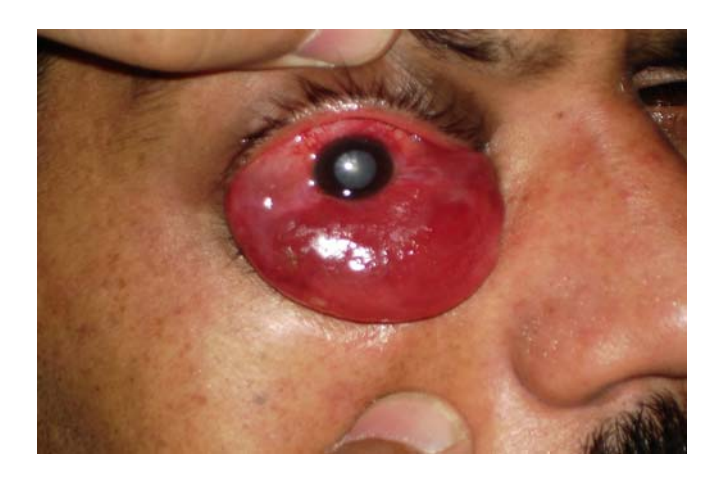
Fig. 2: Closer view. Arrow indicates dilated fixed pupil and post traumatic cataract.