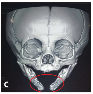
Figure 3. CT scan images A. axial view, B. coronal view, and C. 3D Reconstruction images showing (encircled) median mandibular cleft with widely separated symphysis menti and midline soft tissue defects of the lower lip, anterior portion of the oral tongue (at the frenulum) and subjacent floor of the mouth.