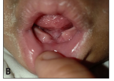
Figure 6. A. 5 months post operation (age 9 months); B. well-healed tongue, floor of mouth, and lip. The baby was thriving with good suckling and swallowing and beginning phonation. (photos published in full, with permission)

the mentum area for adequate closure and better aesthetics. (Figure 4E)