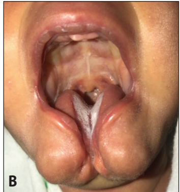
Figure 2. A, B. Oral cavity views revealing bifid tip of the tongue and ankyloglossia. (photos published in full, with permission)

and Index Medicus of the South East Asia Region, there have been no previously published reports in the Philippines. We report what may possibly be the first such case in our country, and the results of our initial soft tissue repair.