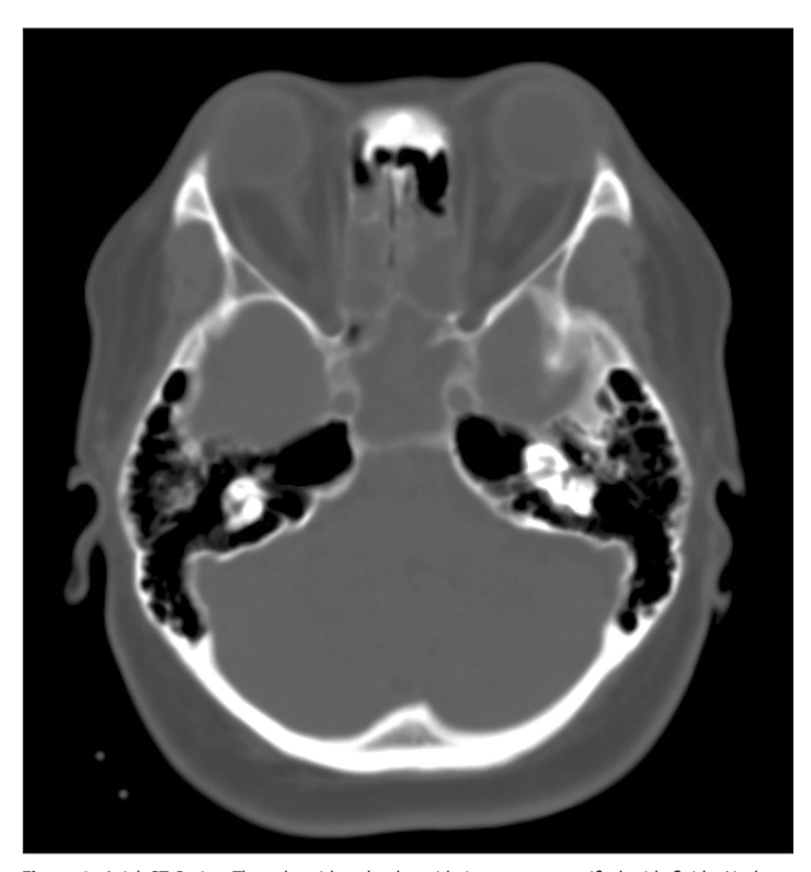
Figure 2. Axial CT Brain: The ethmoid and sphenoid sinuses are opacified with fluid. No bony destruction.

PHILIPPINE JOURNAL OF OTOLARYNGOLOGY-HEAD AND NECK SURGERY