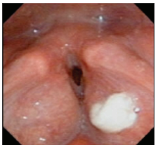
Diffuse laryngeal edema