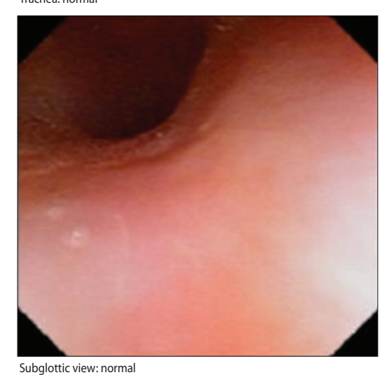
Figure 5. Flexible Endoscopy 3 weeks post-op