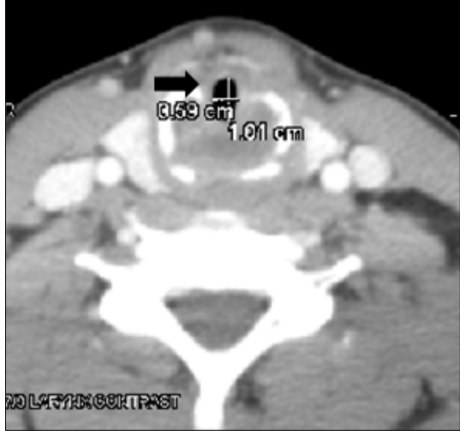
Figure 1. Sagittal and Axial CT scan sections showing glottic and subglottic airway narrowing and irregular first tracheal ring (arrows).