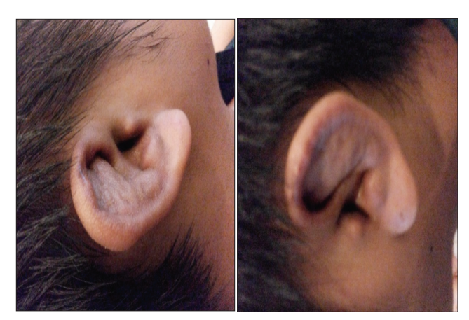
Figure 3. Bilateral aural inflammation