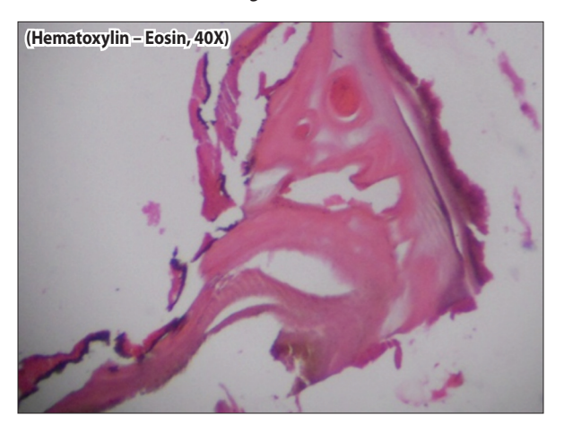
Figure 4. Histolopathologic specimen, Hematoxylin – Eosin, high power magnification (40x) revealed foreign body consistent with bone tissue

The procedure was well tolerated. She was decannulated on the 3<sup>rd</sup> postoperative day and discharged improved on the 4<sup>th</sup> postoperative day. Dyspnea, retractions, halitosis and biphasic stridor resolved completely one week following surgery. The final histopathologic report revealed "bone tissue." (Figure 4)