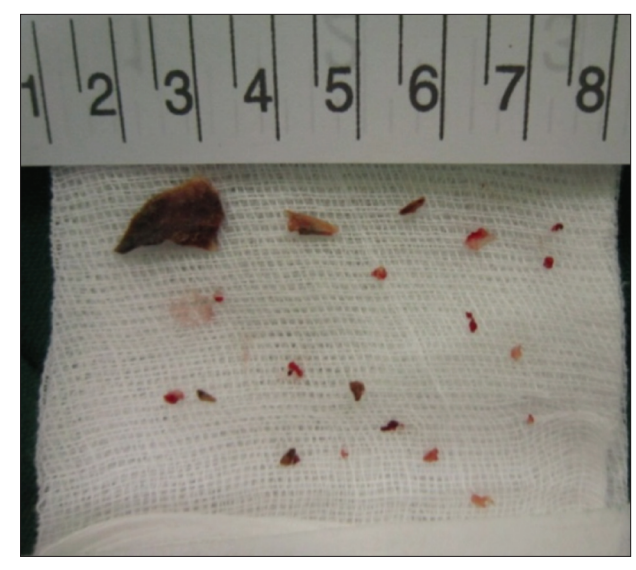
Figure 3. Extracted foreign body measuring 1.5cm x 0.3cm x 0.7cm with granulation

Review of history revealed a choking incident while eating 15 years ago, followed by paroxysms of cough then breathiness of the voice. A general physician consulted advised the patient to rest. Breathiness persisted for about a year associated with recurrent cough and dyspnea. After one year of breathiness and hoarseness, vocal production returned to normal, but she had repeated consults with and admissions under different physicians due to recurrent cough and dyspneic episodes. For 15 years, she had been managed without relief as a case of bronchial