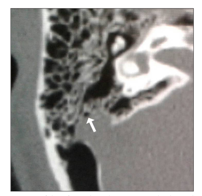
Figure 3. Magnified view of Figure 1 showing the "air-on-sinus" sign, where the mastoid air cell directly contacts the sinus wall, without any overlying bone (white arrow)

How significant is this condition? Sigmoid sinus diverticulum and/ or dehiscence is being increasingly recognized as a common cause of pulsatile tinnitus. In fact, a recent study by Schoeff et al. found its prevalence to be 23% in patients with pulsatile tinnitus.<sup>4</sup> As such, the identification of this condition is highly relevant particularly because effective surgical management is available for its alleviation.