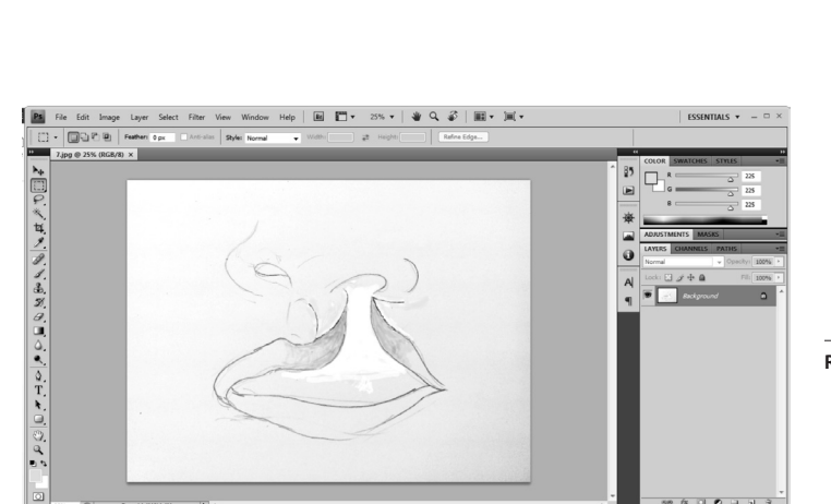
Figure 2. Screenshot showing image of cleft lip done on Adobe Photoshop CS4

Not every scientific idea or step in a surgical procedure is available as a visual presentation in textbooks. Much is explained in textual form and interpretation is left to the intellectual capacity of the reader. This may be one of the reasons why learning some concepts is challenging. Through rendering animated demonstrations, grasping the essence of scientific concepts and surgical procedures and thereby learning can be assisted. Our results need to be tested and the learning outcomes compared in order to establish their value and this may be the subject of a future study.