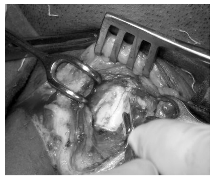
Figure 2. Making Incision Lateral to Midline of Thyroid Cartilage