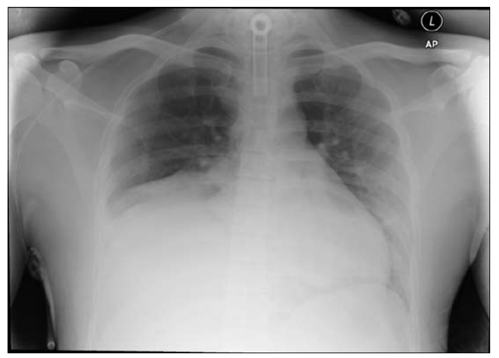
Figure 1. Preoperative chest radiograph showing an elevated right hemi-diaphragm at the level of the seventh right posterior rib.

The patient was subjected to vigorous chest physiotherapy, and started on naso-gastric tube feeding to allow recovery of the larynx. He also developed hospital-acquired pneumonia which resolved with intravenous antibiotics. The patient was carefully monitored and continued to make an otherwise uneventful recovery. A repeat chest x-ray one month after the trauma showed a normal diaphragmatic level. Two months after the trauma, decannulation of the tracheotomy tube