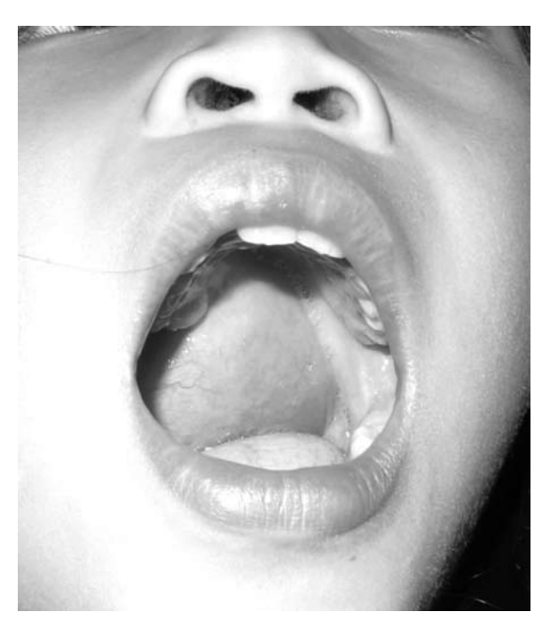
Figure 1 B. Close-up intraoral view showing palatal involvement. The right parapharyngeal wall was similarly involved.

deformities and functional deficits. Our patient has a noncutaneous plexiform neurofibroma but did not meet the criteria for the diagnosis of neurofibromatosis I.