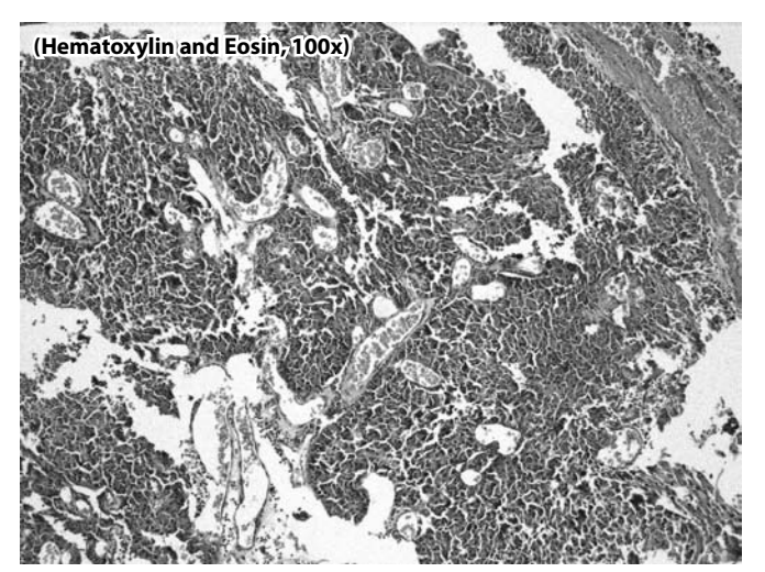
Figure. 2 Infiltrating tumor with a papillary configuration and focally with solid areas. Vascular channels are prominent (Hematoxylin and Eosin, 100x).