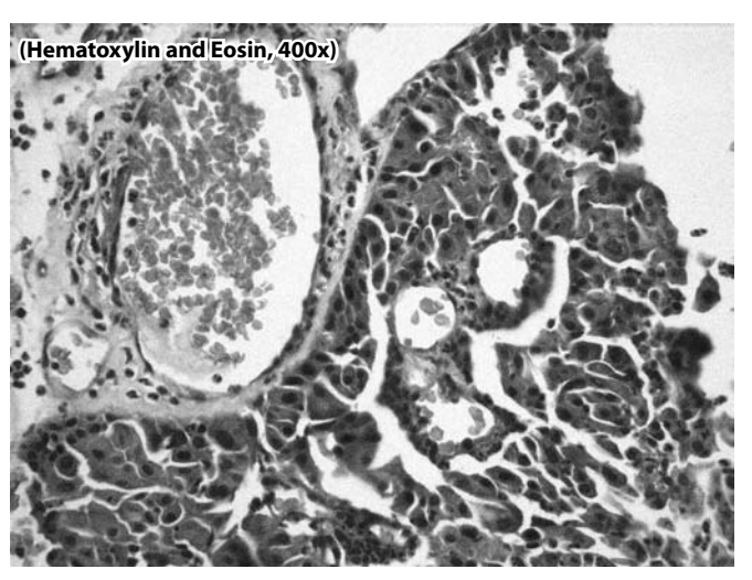
Figure. 3 The tumor cells are cuboidal to polygonal, have large, angular and hyperchromatic nuclei, do not have distinct nucleoli and have rare mitoses (Hematoxylin and Eosin, 400x).