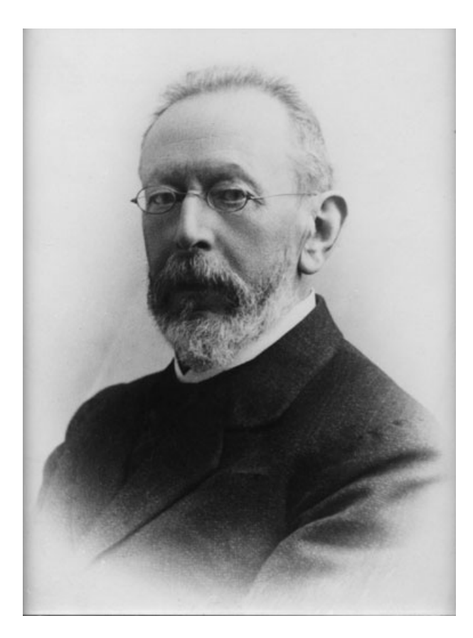
Fig. 1 Professor Henrik Mohn (1834–1916).

four countries were able to confirm sufficient economic backing from their governments, and it was decided that the IPY had to be postponed until 1882–83.