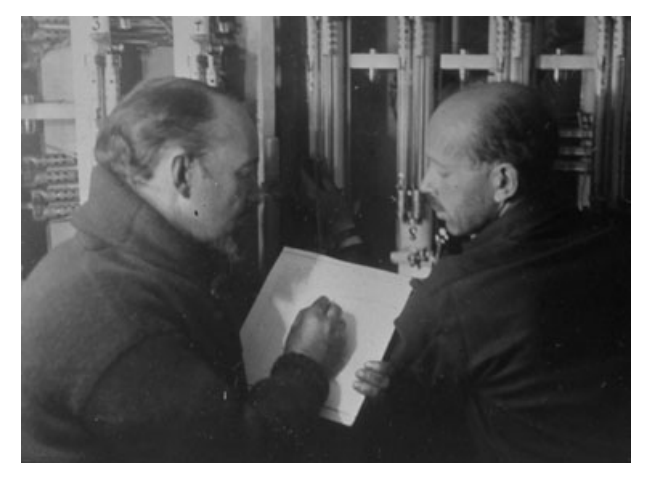
Fig. 6 Hubert Wilkins (left) and Harald Ulrik Sverdrup on board the submarine Nautilus , measuring temperatures deep down in the Arctic Ocean.

was the Vøring expedition, 1876–78, which explored the Norwegian Sea and, in fact, gave that body of water its name (Bjørnsen 2003) (Fig. 5). (The first polar expedition sent from Norway had been Christopher Hansteen's