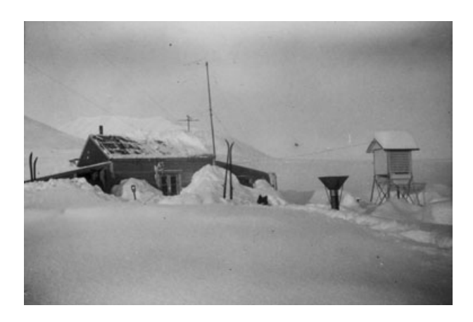
Fig. 8 The Norwegian station Jonsbu, Greenland, in March 1933.

tific knowledge of a "new" territory were able to win most conflicts of interests with other countries (Drivenes 1994–95; Drivenes 1995).