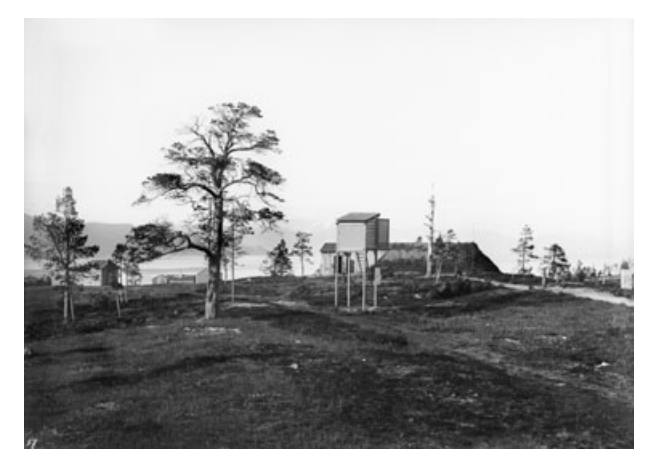
Fig. 2 The Norwegian polar station in Bossekop. Some of the meteorological instruments and the magnetic hut can be seen. The Breverud farm was rented for 800 kroner per year.

The whole idea seemed to be hanging on a thread. In January 1881 there were still only five countries that were able to confirm economic support for their polar stations, namely Russia, Austria-Hungary, Sweden, Denmark and Norway. In spite of this, the president of the International Meteorological Commission, Professor Heinrich Wild of St Petersburg, pushed forward a resolution saying that the IPY was to be arranged even if only five countries could take part. Norway was the only country that resisted this decision. Professor Mohn said that the Norwegian Parliament had given its grant on the premise of a minimum of eight participating countries. The best he could do, Mohn said, was to delay the deadline for Norway's final decision until 1 May 1881. During the winter of 1881 it seemed that plans for the IPY had come to a standstill, a situation that was not improved with the death of Carl Weyprecht on 29 March. But his idea proved to be blessed with good fortune, and on 14 May 1881 Professor Wild announced that at least eight stations would be carrying out simultaneous observations during the IPY.