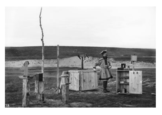
Fig. 3 Sophus Tromholt's auroral observatory in Kautokeino 1882–83. In the middle of the picture you can see the Mohn theodolite, which was used in triangulating the position of the aurora.

What an endlessness of numbers! At each of the hourly observations, more than one hundred ciphers are noted; thus one normal day represents approximately 2500 ciphers, one term day about 6000. (Tromholt 1885: 55; translated by the author)