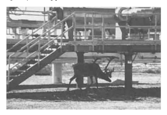
A Central Arctic Herd caribou bull escapes the summer heat in the shade of an oil processing facility at Prudhoe Bay, Alaska. While caribou cows generally avoid oil fields during calving, animals commonly utilize building shade and raised gravel pads for insect and heat relief in the summer.