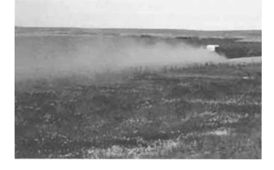
Relatively alkaline (pH ca. 8.0) road dust, as seen here on southern Yamal, July 1995, alters substrate chemistry and patterns of nutrient content in vascular and non-vascular plants which serve as reindeer forage. Road dust has also been reported to significantly reduce the production of cloudberry ( Rubus chamaemorus ) fruits and mushrooms in the mires adjoining the main transport corridor on southern Yamal (see Klein, this issue). Photo: B. Forbes.

Such sites as this abandoned gas test well, central Yamal Peninsula, June 1993, are widespread throughout Yamal and are problematic for several reasons: (i) slow revegetation due to dry, nutrient-poor and unstable sand surfaces; (ii) deflation of sand/ dust to the surrounding area, resulting in the rapid burial of tundra vegetation; (iii) toxic drilling muds often left on the surface; and (iv) rusted metal, broken glass and other trash which can injure reindeer's hooves. Photo: B. Forbes.