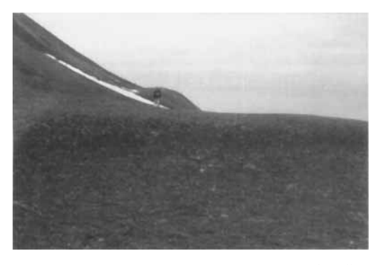
Fig. 2. A distinct and well-preserved pre-Late Weichselian raised beach terrace at 50 m asl. The terrace is built against the mountain slope and it can be followed for more than 100 m in the terrain. The person is 1.85 m tall.

ice sheet expanded on a broad front out to the continental shelf edge, 50-100 km off the present west coast, and that only some of the >1000 m asl mountain peaks on Prins Karls Forland could have remained ice-free. In this context, the main aim of this note is to report the observation of multiple generations of raised beach deposits and associated <sup>14</sup>C ages from Pricepynten, southern Prins Karls Forland, that may indicate that the area remained ice-free during the Late Weichselian.