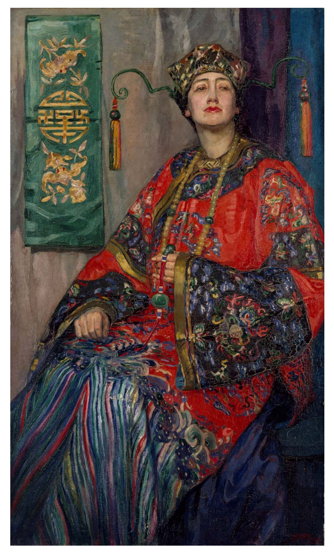
Figure 2, Hilda Rix Nicholas, La robe Chinoise , c.1913, oil on canvas, 185.3 x 115 cm, State Art Collection, Art Gallery of Western Australia, purchased through the Sir Claude Hotchin Art Foundation, Art Gallery of Western Australia Foundation, 1994.