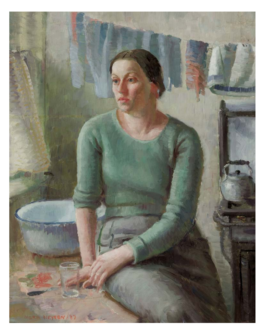
Figure 5, Nora Heysen, Down and out in London , 1937, oil on canvas, 55.0 x 40.0 cm, South Australian Government Grant 1994, Art Gallery of South Australia, Adelaide.

London self-portrait Down and out in London , 1937 [figure 5], alludes to her impoverished state, and shows her in modest domestic environs perched on the kitchen bench, the stove close by and laundry hanging behind her. The luscious greens of her clothing and the calm, relaxed pose imply that she has found her painting style; her hand resting on her palette points to the modern colours and areas of broken colour she has employed in her painting.