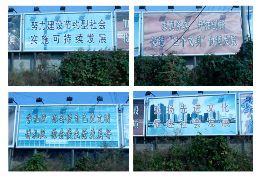
Figure 6: Billboards in the streets of Beijing in 2007–2008 © Maurizio Marinelli.

'Strengthen the construction of morality in the way of thinking. Elevate the cultural quality of the citizens.'