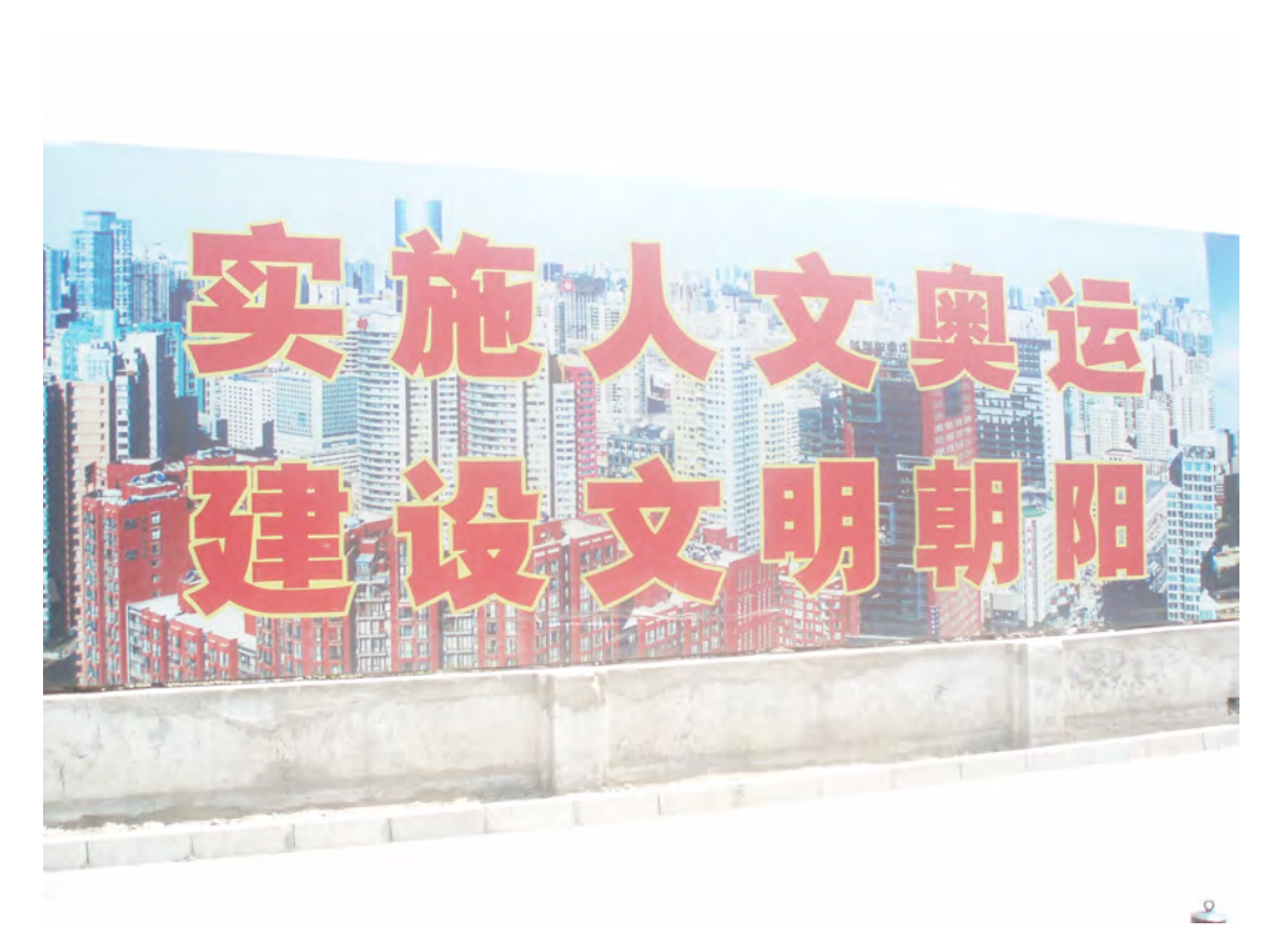
Figure 4: Billboard hailing the 'humanistic' Olympics and the construction of a 'civilised' Chaoyang district in Beijing. Beijing, 2008