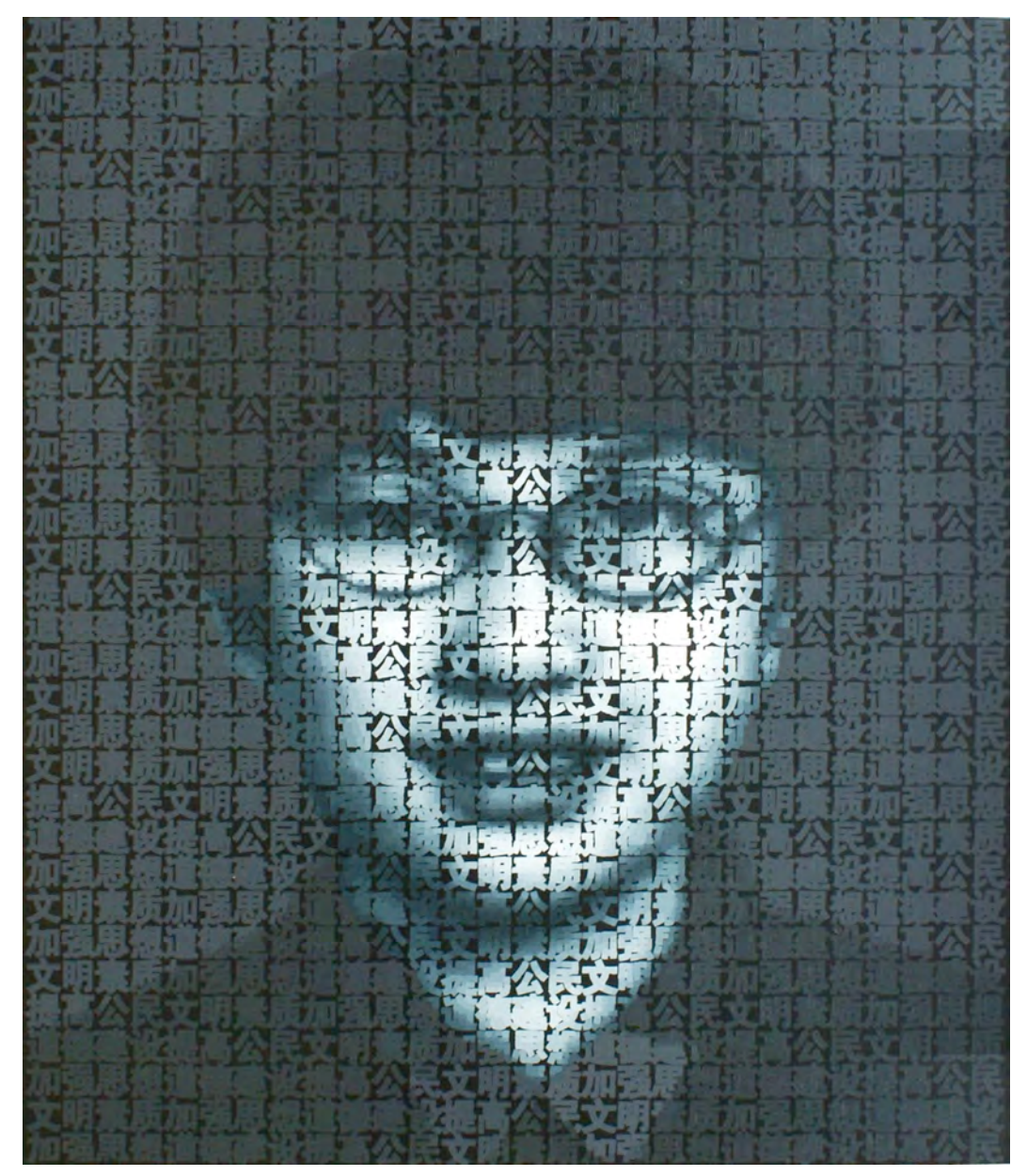
Figure 8: Zhang Dali, Slogan No. 6, 'Strengthen the construction of moral thought,' 182 x 223 cm, 2007 © Zhang Dali.

China, during the Maoist era (1949–1976), images and texts effectively coexisted, to the extent that the text framed the ritual of truth of a claimed reality (Apter & Saich 1994; Ji 2004; Marinelli 2009). In Mao's China, the slogans effectively set the boundaries of linguistic expression, within the framework of a skilfully constructed epistemological and ontological universe. In the Chinese historical tradition, the 'correctness' of language has always been considered a source of moral authority, official legitimacy and political stability. Political language has always had an intrinsic instrumental value, since language control is the most suitable way to convey and maintain the orthodox State ideology. Formalised language has also functioned as a powerful means to