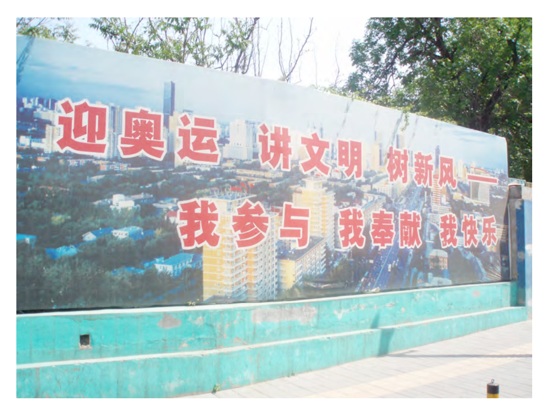
Figure 2: Billboard 'Welcome the Olympic Games—Stress civilisation—Establish new habits.' Beijing, 2008

Dali's artwork entitled 'The Slogan Series.' The artist is particularly interested in exploring 'the real society ( shehui xianshi 社会现实).' His denunciation of the violence of the Olympics hegemonic language, led him to appropriate the official slogans to create thought-provoking text-images, with the aim of preventing collective amnesia. The analysis of Zhang's work will reveal the aesthetics and socio-political implications of his artworks, which originate from his dual intention to problematise what happened to the 'real society' in the city where he lives and, at the same time, to bridge the gap between art and 'real' space, asserting the right to a new language to inhabit the city.