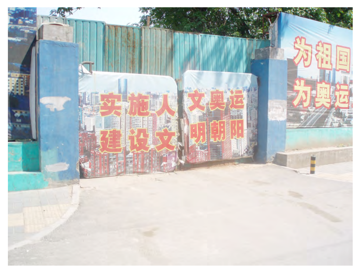
Figure 5: Split billboard juxtaposed to a gate outside a development site. Beijing, 2008.

The cityscape's images belonged to Beijing, although some of them could have also been drawn from other generically globalising Chinese metropolises. Fragments of high-rise buildings appeared and disappeared, partially concealed by the characters. In terms of scale, the dimension of the characters, and their relevant visual effect, was overwhelming.