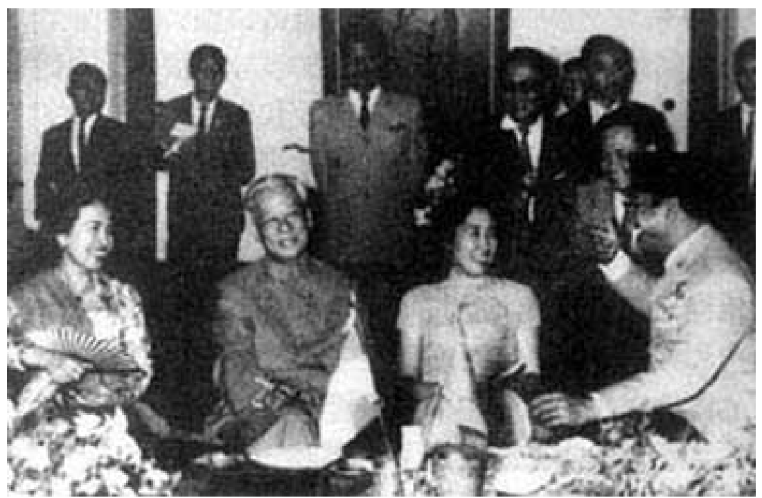
Figure 1: The official banquet hosted by President Sukarno during Liu Shaoqi's and Wang Guangmei's state visit to Indonesia in November 1963.

Imaginative texts can even become agents for violence. This was often the case during the Cultural Revolution.<sup>2</sup> For example, the 'ugly photograph' of Liu Shaoqi's wife, Wang Guangmei, wearing a body-clinging qipao dress (旗袍) during a banquet hosted by Indonesian President Sukarno in November 1963 during their State visit (Figures 1 and 2),<sup>3</sup> sparked the violence against her in April 1967, when the Red Guards, perpetrating a grotesque historical nemesis, openly criticized her on public stage after