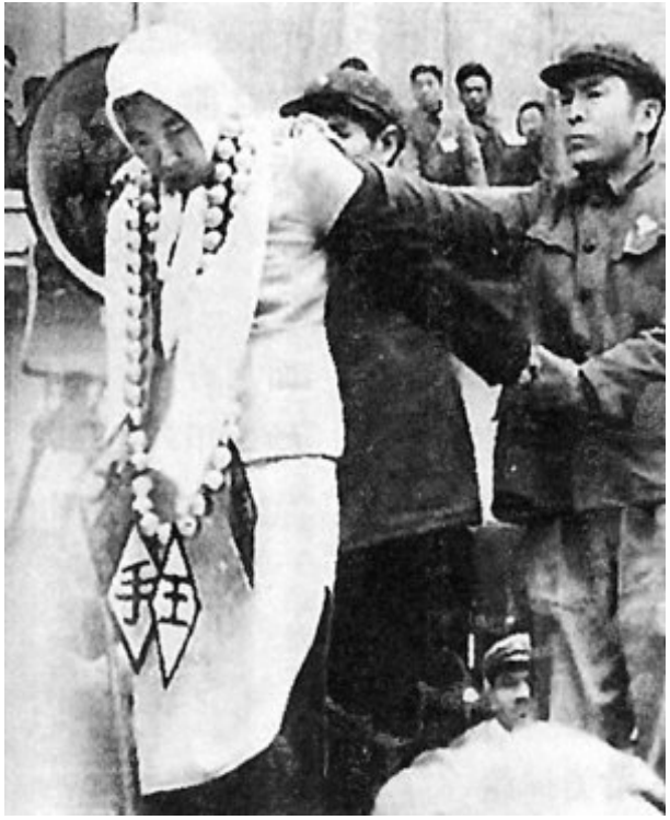
Figure 3: Wang Guangmei criticized by the Red Guards in April 1967.