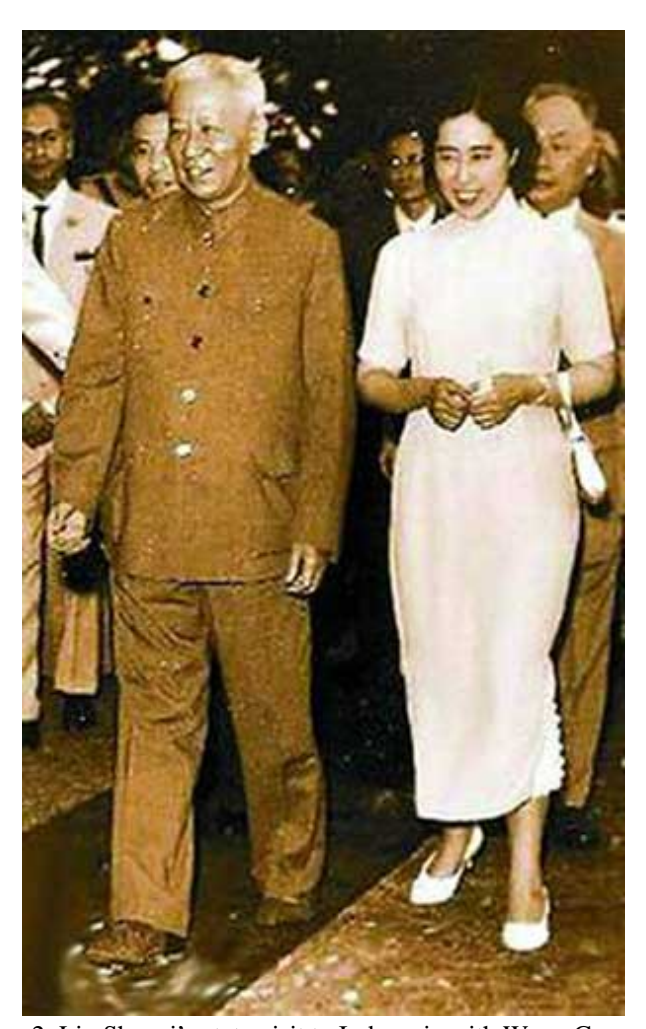
Figure 2: Liu Shaoqi's state visit to Indonesia with Wang Guangmei.