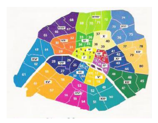
Figure 2: Map of inner Paris showing division of arrondissements into quartiers (Belleville is quartier no. 77).

Parisians.<sup>3</sup> Despite this lowly ranking, the quartier attained new prominence as a utopian space during the 1990s, principally due to the phenomenal success of Daniel Pennac's series of Malaussène novels (1985–1995).