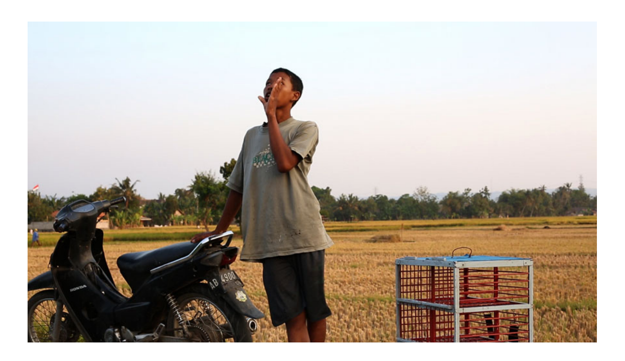
Figure 4: Pigeon Racing Training, Yogyakarta, digital photograph, 2015

sum even for a young, unpaired male bird. He hopes to enter the next local competition in Bantul, where the winning prize is a motorbike. As we talk he releases one of his pigeons and it disappears into a rice field. The field is yet to be harvested and the stalks make it difficult to locate one small pigeon. Everyone forms a line that scours the field for the missing bird. Mas Sigit calls out with the female bird in one hand. Half an hour later it emerges, hopping, as one trainer laughs, like a frog between the stalks.