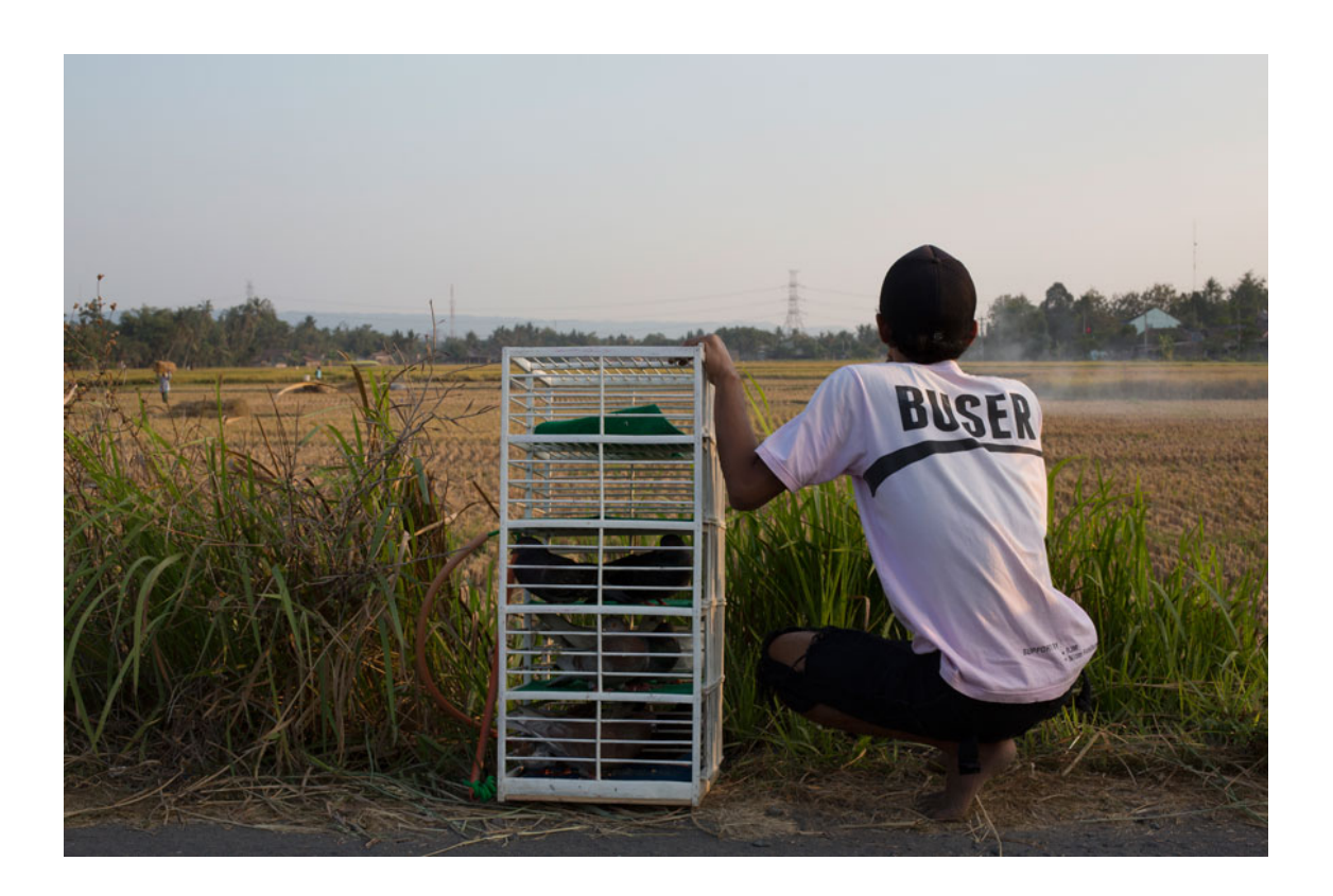
Figure 3: Pigeon Racing Training, Yogyakarta, digital photograph, 2015

backs. They release the male birds in pairs and then signal back to the men waiting at the goalposts by walkie talkies. The pigeon as it races from A to B is a homing device, the female essentially signalling to its mate. Back at the square men wait and watch for the pigeons to appear in the sky, much like how I know surfers to stand on the shore and watch for a set of waves to come in—a line of men linked through idle commentary, all watching the same point on the distant horizon. Once the male bird is in sight the pigeon handler will step into the square as if it was a stage. Holding the female bird in his hands, he will shake her up and down, at the same time calling loudly out to the male. Upon reaching the goalposts the male bird dives down through the top square and lands on the back of his mate. This type of racing is called merpati balap : short distance sprint racing.