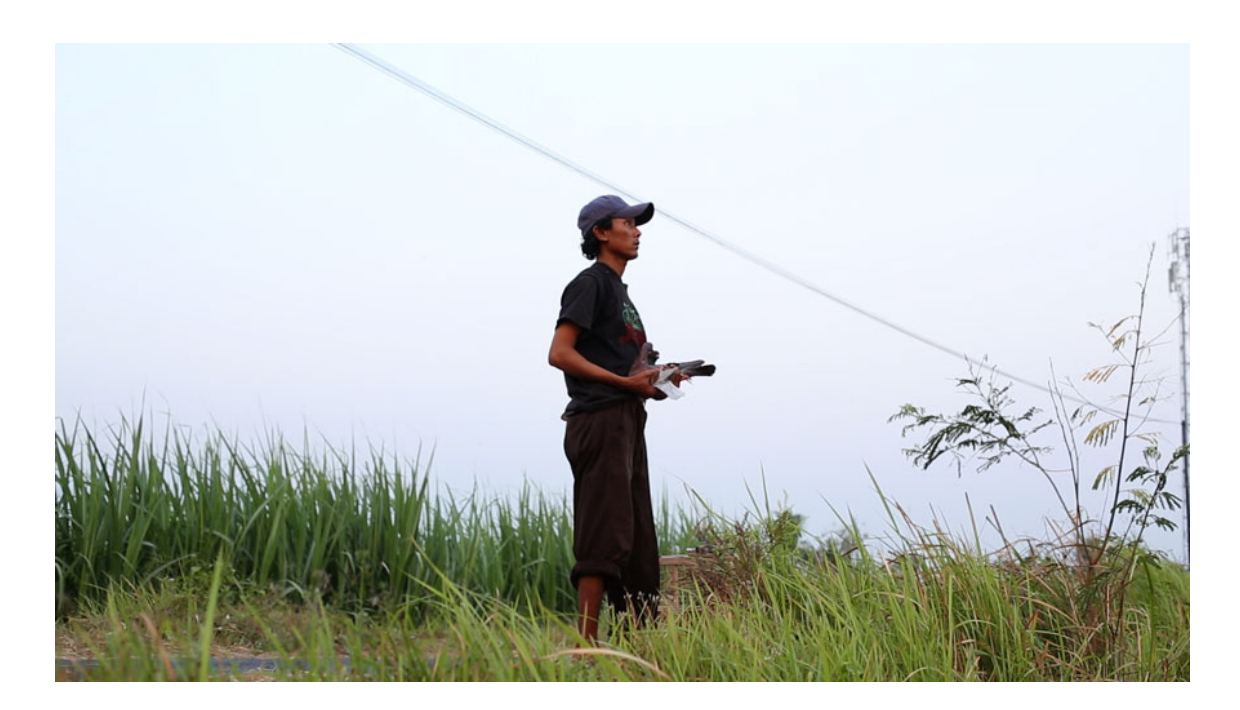
Figure 2: Pigeon Racing Training, Yogyakarta, digital photograph, 2015

Pigeons mate for life and pigeon racing in Java operates through separating the male bird from his hen, so he will instinctively fly back to her. The practice is known in European traditions as widowing. It is a sport that is enacted through a series of performative signalling between two locations. The men who release the male birds drive out to the starting point by motorbike with the pigeons in cages strapped to their