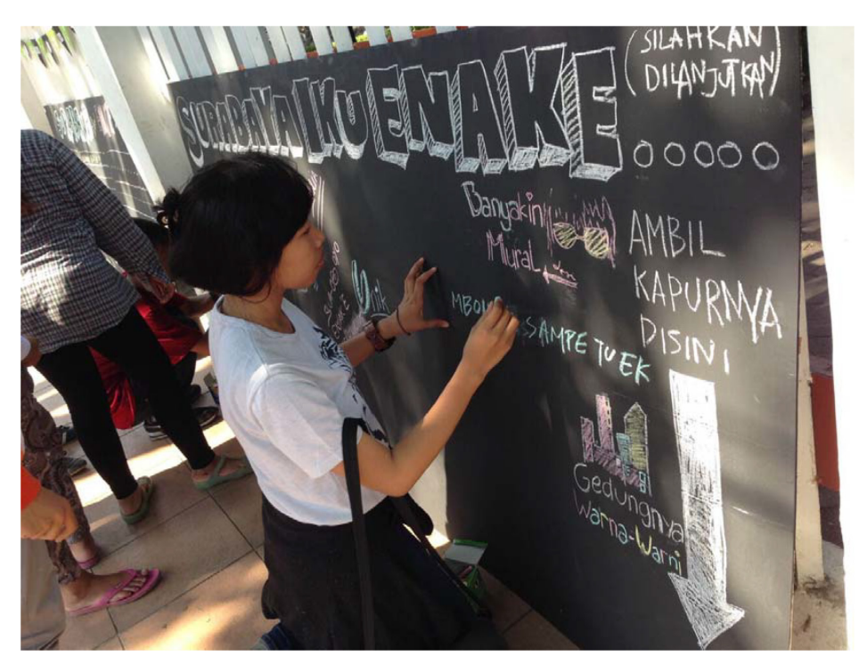
Figure 6 The closing of the 4<sup>th</sup> DIYSUB in 2014, held in the library of the Bank Indonesia. We put up blackboards along the pavement, encouraging passerbys (from the Car Free Day held every Sunday morning) to write what they wished for Surabaya. We were leisurely enjoying and observing the scene, when we were suddenly notified that the Mayor, whom we'd lobbied for months without any reply, wished to drop by and speak during the first panel