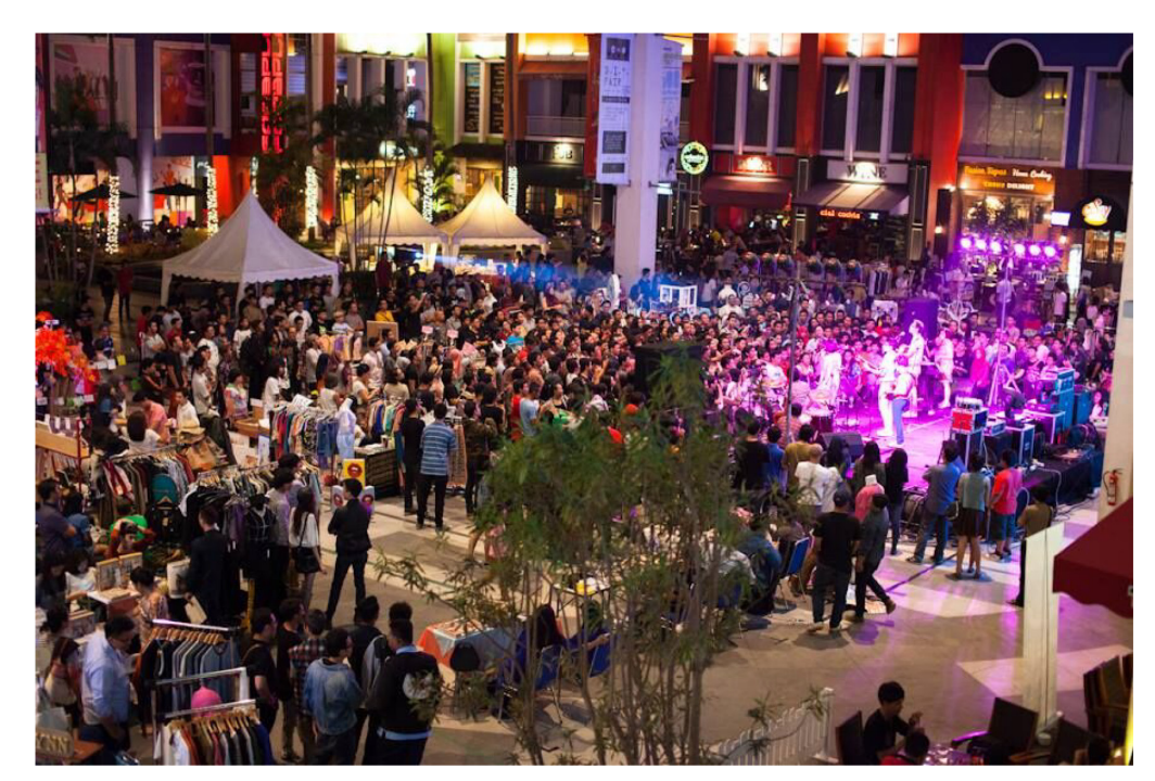
Figure 3 We received an offer from an event organiser working in a shopping mall in Surabaya to organise part of the 3<sup>rd</sup> DIYSUB within its compound. This immediately boosted the visibility and attendance turnout, but we also realised the spatial limitations that significantly modify visitors' engagement. Under the spotlight in the photo is White Shoes & the Couples Company, whose members are also active as musicians and designers. The night before they also gave a talk sharing their design processes