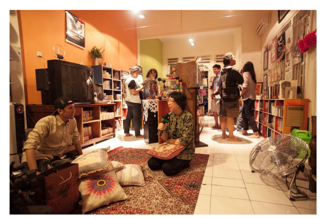
Figure 1 An exhibition organised as part of the 2<sup>nd</sup> DIYSUB in in C20 library in collaboration with BRAngerous, a collective of female artists in Surabaya