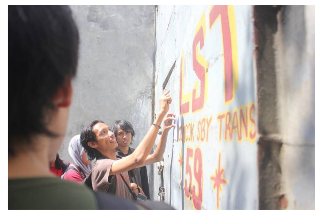
Figure 4 In the 4<sup>th</sup> DIYSUB, we organised a design walking tour exploring the typography of the old Chinatown in Surabaya

Figure 3 We received an offer from an event organiser working in a shopping mall in Surabaya to organise part of the 3<sup>rd</sup> DIYSUB within its compound. This immediately boosted the visibility and attendance turnout, but we also realised the spatial limitations that significantly modify visitors' engagement. Under the spotlight in the photo is White Shoes & the Couples Company, whose members are also active as musicians and designers. The night before they also gave a talk sharing their design processes