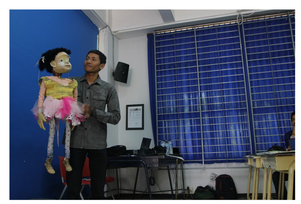
Figure 5 We usually collaborate with local campuses in integrating DIYSUB as guest workshops or talks into the classrooms. Here, we invited Papermoon Puppet Theatre, and received questions from the faculty, such as 'how is puppetmaking related to design?'