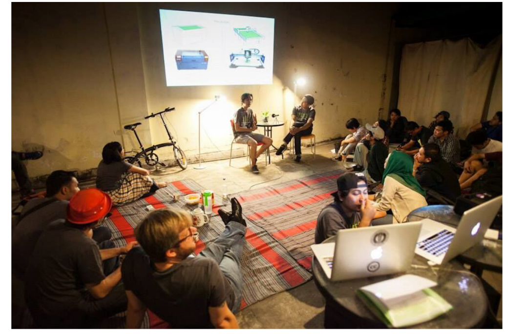
Figure 2 HONFablab contacted us to conduct a roadshow about Fablab in Surabaya. We improvised by tying this roadshow up as part of the 3<sup>rd</sup> DIYSUB to bring more visibility, interests, and link the information about these growing technologies with design practitioners in Surabaya