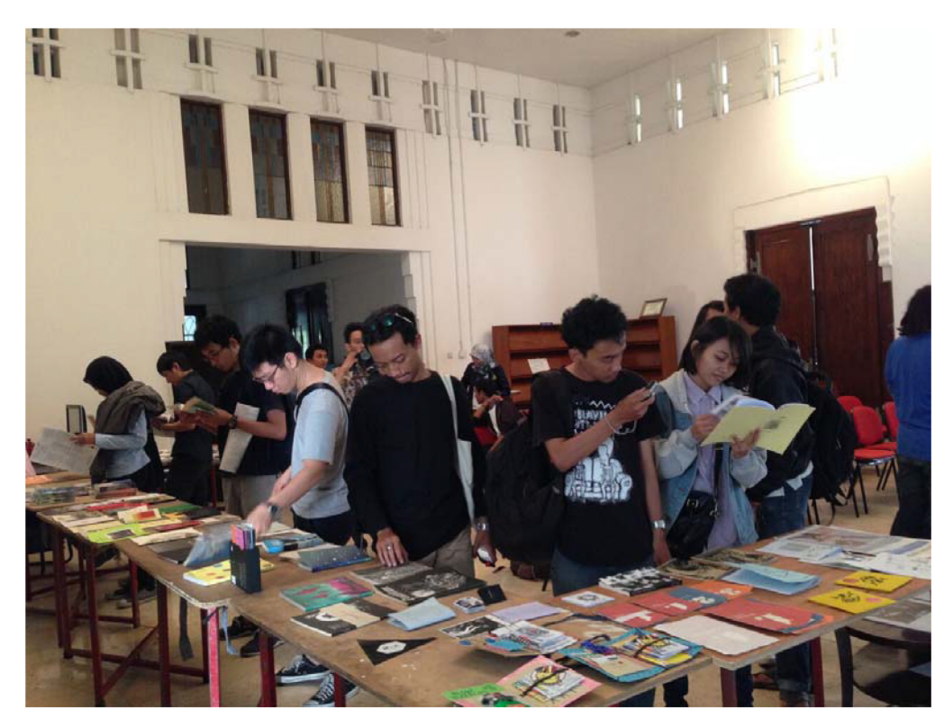
Figure 7 PRINTilan, a play on the word print and printilan, which means ephemera in Javanese language: the zine event at the 4<sup>th</sup> DIYSUB