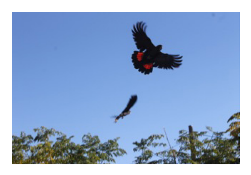
Black cockatoos waking the morning sky, Bre 2016