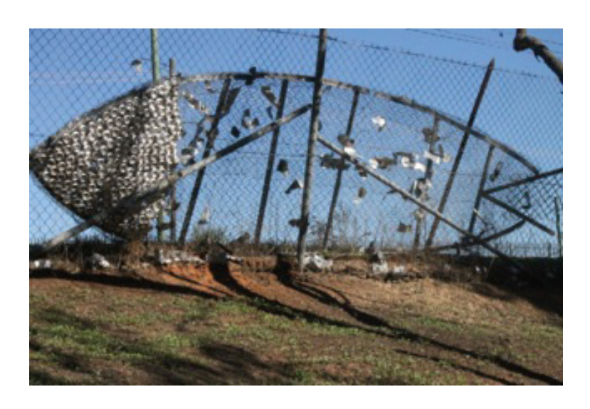
A fish trapped, Bre 2016

Brewarrina is an outback town situated at the point where the Barwon River becomes the Darling, at 119 meters above sea level. The town is some 810 kilometres from Sydney and 98 kilometres from Bourke. Brewarrina has a population of about 1,500 people, with a further 1,500 living on properties around the town. The first European settlers arrived in the district around 1839 and 1840, with the first landowners being the Lawson brothers ('Brewarrina, New South Wales' 2017). Riverboats reached the town in the late 1850s, leading quickly to the town becoming an important port on the Darling River. Brewarrina was the first town in NSW to have two state heritage listings of Aboriginal significance ('Brewarrina, New South Wales' 2017). The first, known as the Ngunnhu (noon-oo) to the local Ngemba people, are the Brewarrina Aboriginal Fish Traps, which are estimated to be more than 40,000 years old. They lie on the bed of the Darling River just downstream from the weir. The traps consist of a series of stone weirs and ponds arranged to form a 'net' that is in effect, a complex piece of engineering: 'The fisheries are pieces of masterful ingenuity designed to trap the fish and to be sealed off so that the fishermen can catch and kill the fish at their leisure' These fish traps are pieces of masterful ingenuity designed to trap fish and be sealed off so that the fishers could catch and kill the fish at their leisure' ('Brewarrina, NSW' 2017).