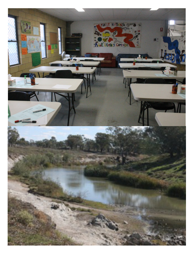
2 Classrooms, Bre 2016

'The language belongs to the land' Arrente Elder