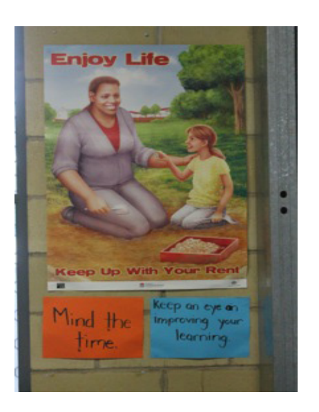
On the Wall: En la Pared. Bre 2016

The facilitator is the mediator between the DVD and the participant; observing and getting information off the students (participants) involved concerning learning or other issues affecting them; working with the coordinator, advisor and supervisors in designing strategies to implement; assisting in the classroom and providing individualized attention; mobilizing and maintaining students' retention; following the students' performance and progress. They gradually gain confidence and are able to work independently with little support. Some of the facilitators from previous intakes are now working either at a small business, at a café or even at school. (Personal communication, June 2016)