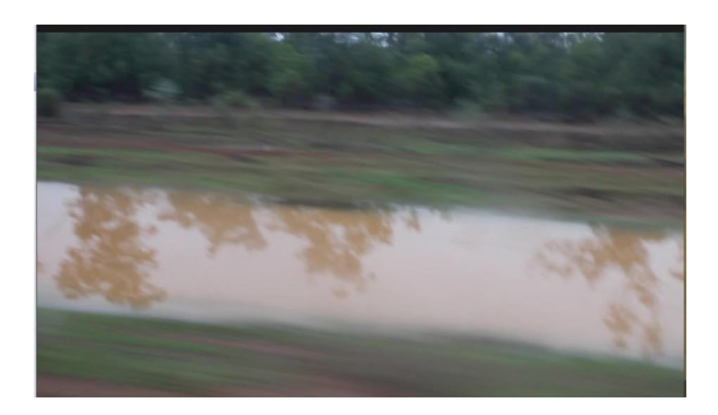
Along the way from Bre to Sydney, June 2016

With eyes half open after almost nine hours driving away from Brewarrina I noticed the colour of the earth changing to red. I cannot avoid thinking of Corrientes, my father's land, which abuts the South Atlantic Ocean. Yet I am here, experiencing other sounds, smells, and textures on my bare feet, my thoughts scattering, co-existing with Australia's First Nations under the same sky. I am learning to observe this country with different eyes, and to listen to the stones, to read the carvings and the signs that mark my way back, to name the way of the stars that disclose where to search and hunt. Here is a culture that survived millennia and is still resilient, creative, innovative, strong, alive: how can we still be so blind before so much knowledge?