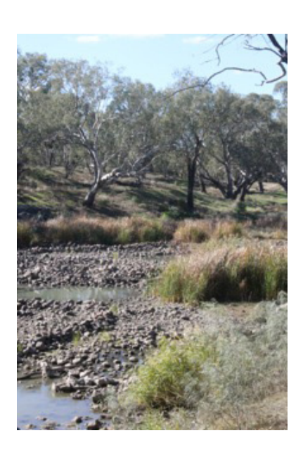
Fridge, Bre 2016