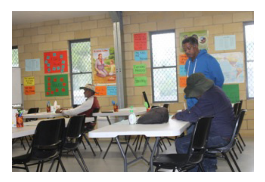
Early in the day – teacher and students, Bre 2016