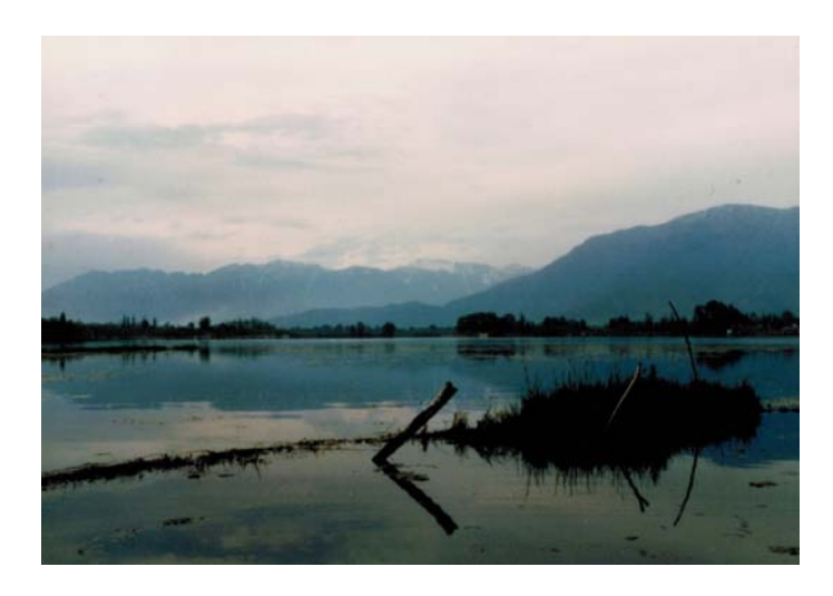
Heavenly Nigeen Lake, 1991

Sunset prayer— God is great —and gunfire echoed around the valley. Like the Kingfisher birds, the noise no longer bothered me or moved me from Nigeen Lake, Srningar. I paused until it settled, before asking Abdul, 'When will it end? When can we go out?'