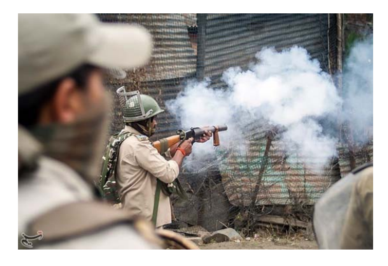
Police, Protesters Clash after Eid Prayers in Kashmir September, 02, 2017.