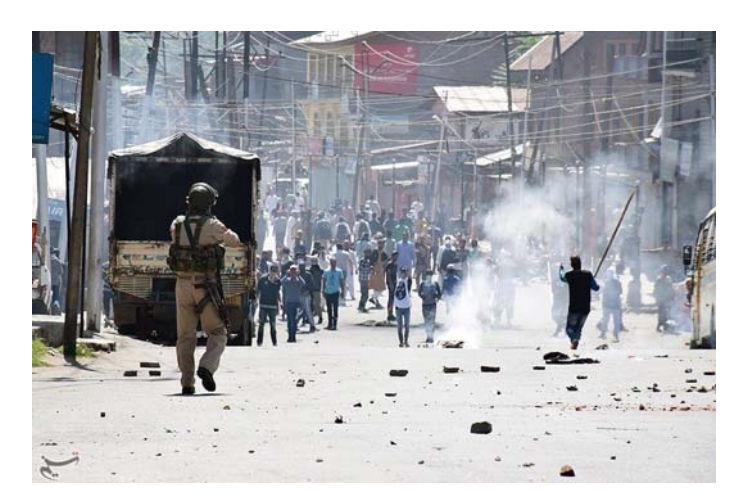
Police in Kashmir, 2018.

In the morning, I woke with a stupendous hangover. After downing aspirin, I shoved clothes into my backpack. On top came the 'guaranteed' hundred percent silk Kurti, and the paper-mache bowls I bought