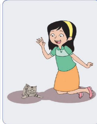
Figure 16: The story Dayu and Si Mungil

Sekarang Dayu sudah kelas 4 SD. Senang sekali hatinya ketika suatu hari ibu memberinya izin untuk memelihara seekor kucing. Setiap sore, kucing belang berwarna hitam-cokelat itu berkeliaran di halaman rumah Dayu. Dayu memberinya nama Si Mungil, sesuai dengan tubuh mungilnya.