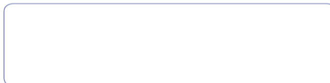
Figure 13: The question about preserving the sustainability of the bird of paradise

Apa yang bisa dilakukan untuk menjaga kelestarian burung cenderawasih?