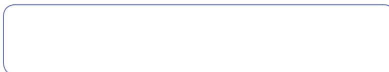
Figure 14: The question about protecting butterflies

2. Apa yang bisa kamu lakukan untuk melindungi kupu-kupu?