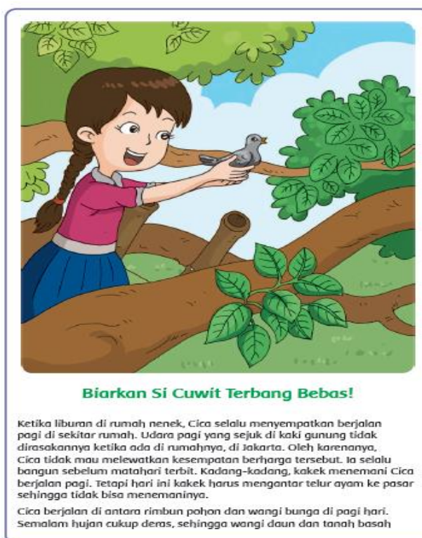
Figure 19: The story let si Cuwit fly freely!