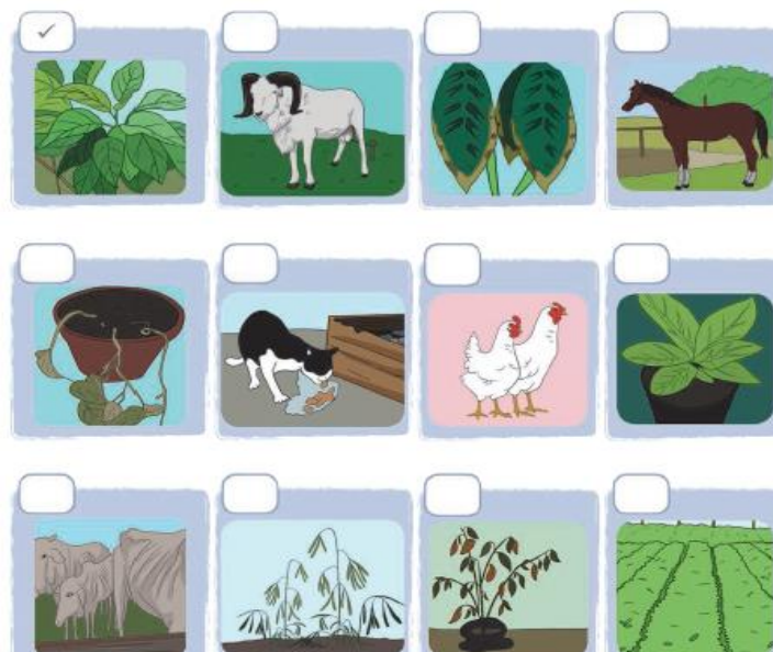
Figure 10: Choosing plants and animals that were taken care of

Ayo, amati gambar berikut. Berilah tanda centang (✓) pada gambar yang menunjukkan tanaman dan hewan yang terawat.