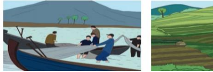
Figure 1: Gotong royong activity