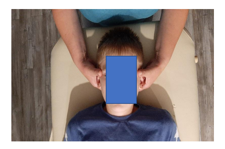
Fig. 3. Assessment of the mobility of the sphenoid bone - the so-called wedge grip [30].