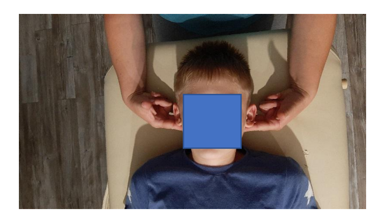
Fig. 4. Normalization of the vagal tone - the "spread V" technique.

It is a technique aimed at inhibiting the activity of the vagus nerve. The hands of the therapist are placed on the temporal bone: finger II - on the styloid process, finger III - on the mastoid process (fingers form "spread V"). During the patient's exhalation, the therapist makes a gentle movement away from the above-mentioned bone elements, normalizing the nerve tone [30].