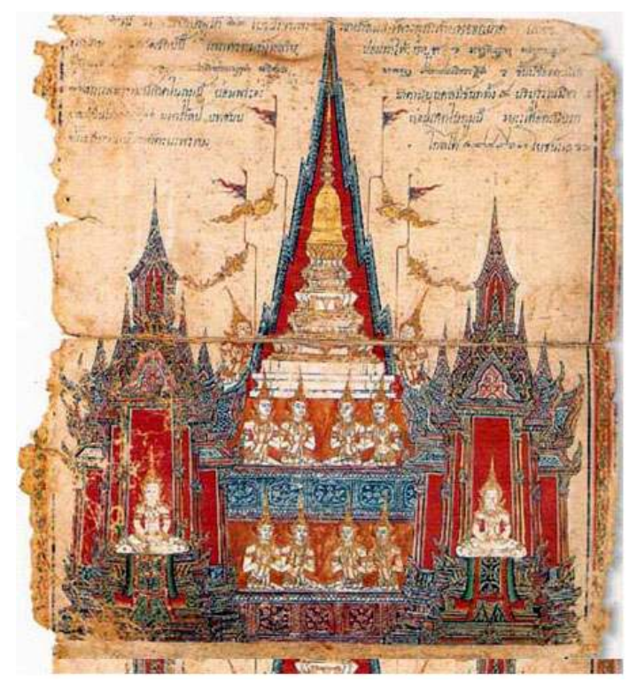
Thai traditional/religious book which was made of pulp and palm leaves.

Laska and Goldstein add that in some educational contexts, files, slideshows, practical scientific experiments, and field trips were part and parcel of the showing method. (Laska & Goldstein, 1973; 6-7)<sup>36</sup> We might add that images of the Buddha, religious paintings, and other religious graphic material were used in Ethics Instruction during the educational reform period. In addition, field trips to monasteries, seminaries, and other religious establishments formed part of the method. In this way, temples became crucial educational resources. Such trips helped shape children's educational and religious development, and their appreciation of the relevance of ethics in their personal lives, and in the overall social development of Siam.