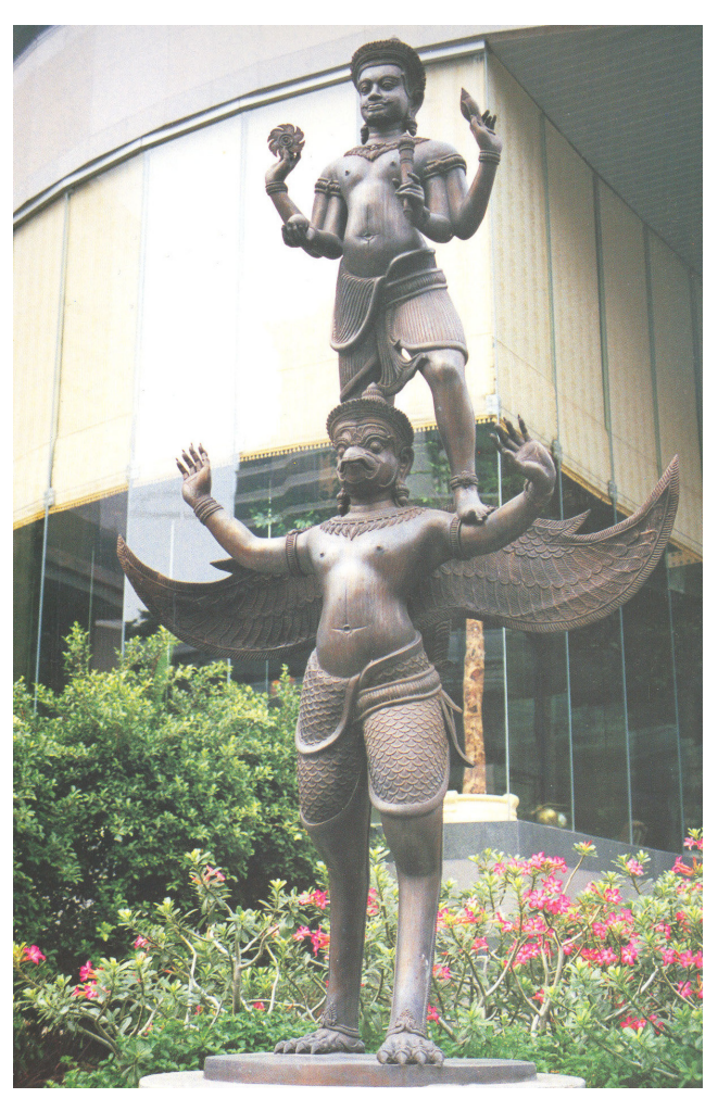
Statue of Vishnu (Narai) standing on Garuda, Bangkok