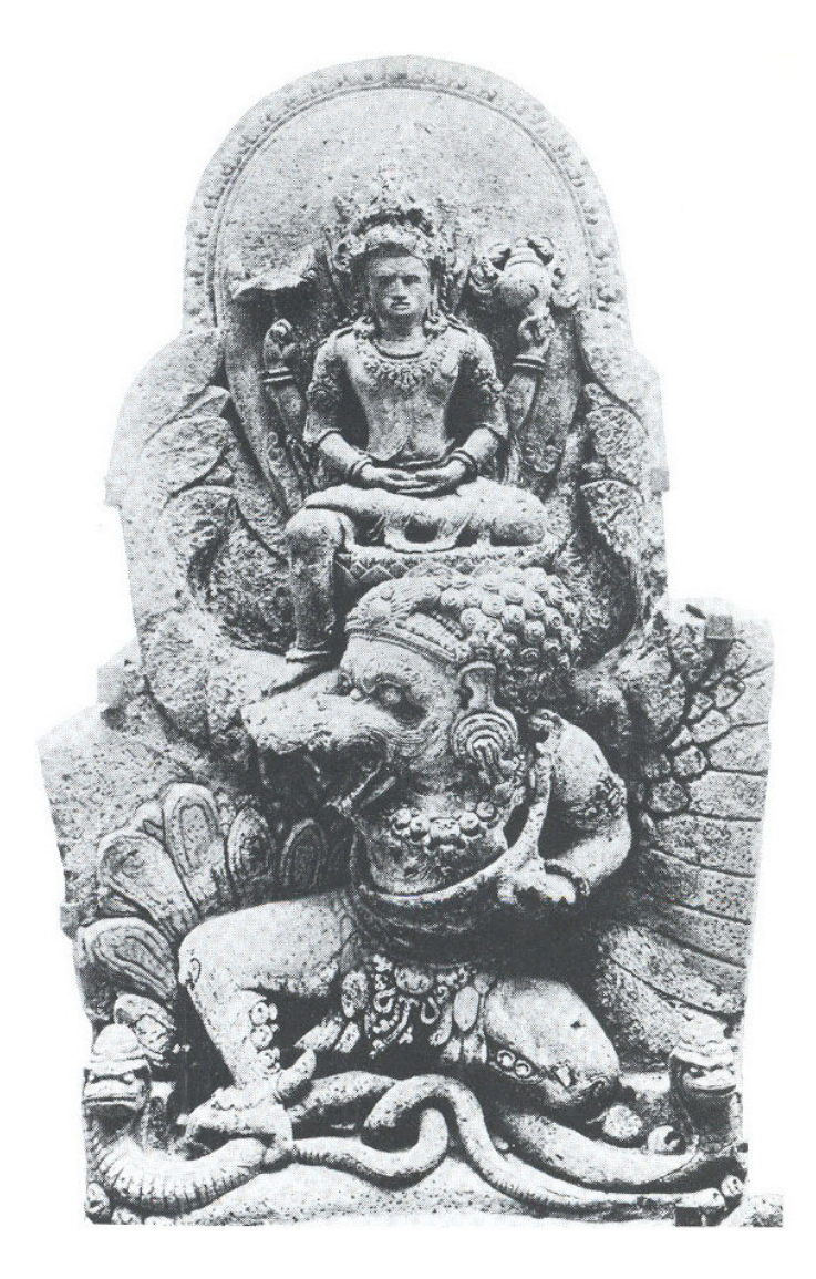
Portrait of King Erlanga, as Vishnu on Garuda. c. 1043 A.D.