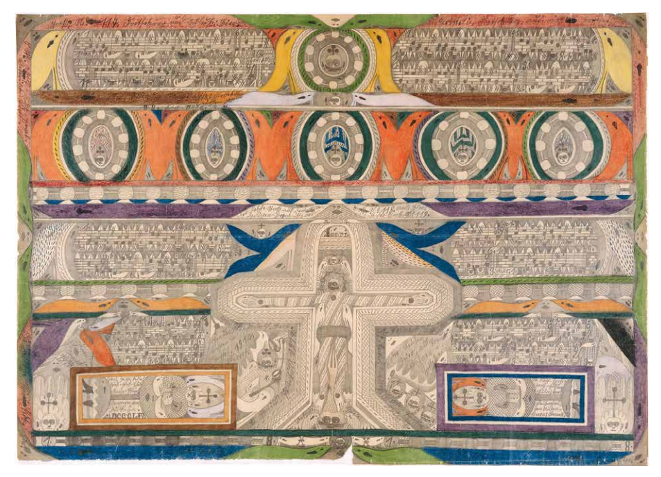
Figure 5: Wölfli 1914. Die Kreutzigung des heiligen Skt. Adolf. © 2021 Adolf Wölfli Stiftung

In figure 5 ( Die Kreutzigung des heiligen Skt. Adolf ), the presence of the musical component and the Christian theme are intensified. The musical notes, the facial self-portraits and the crosses are arranged around a Christian crucifixion of an ornamental Adolf Wölfli-like image, in which a crown of thorns and marks of spikes in hands and feet are visible. The elements, birds and snails, are inserted in every bit of spaces