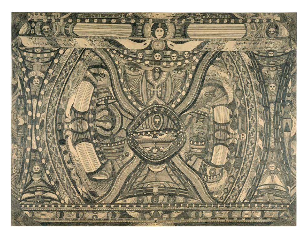
Figure 1: Wölfli 1905. Mediziinische Fakultäät. © 2021 Adolf Wölfli Stiftung

Prajñā Vihāra Vol. 22 no. 1 January to June 2021, 85-109© 2000 by Assumption University Press