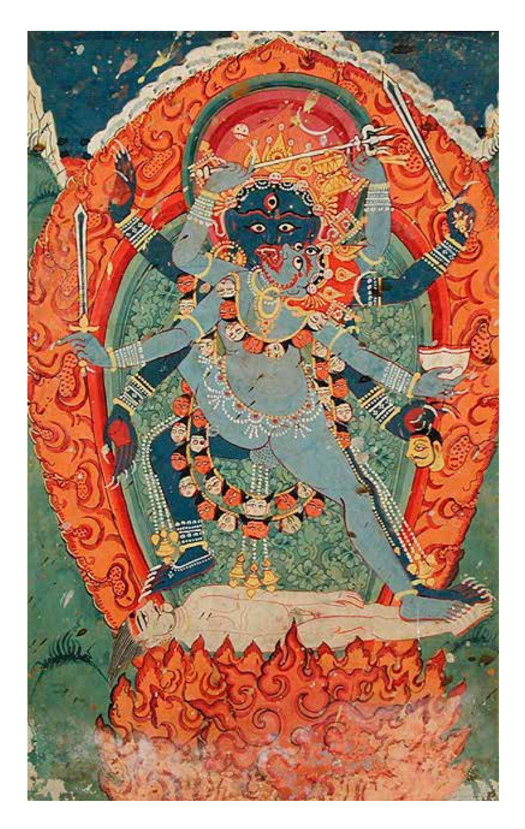
Figure 2: The Hindu Goddess Kali and God Bhairava in Union. Painting; Watercolor. Los. Angeles County Museum of Art.