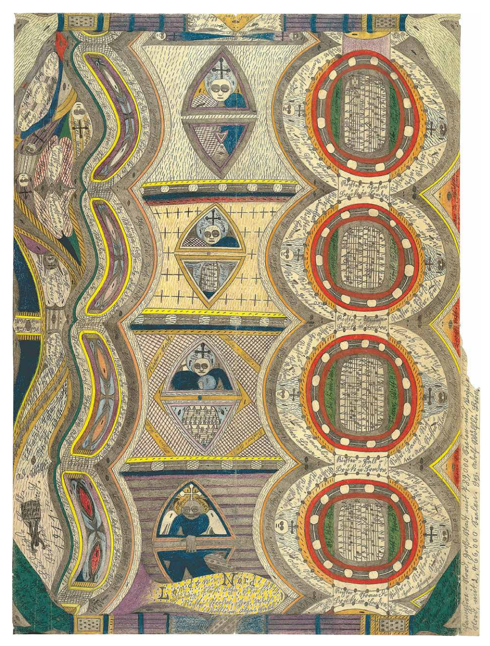
Figure 4: Wölfli 1911.London=Nord. © 2021 Adolf Wölfli Stiftung

around a diagonal strip, the river, and the entire drawing is framed with stylized self-portraits, 'snails' and ' vögeliis '. The strips direct the flows, making the drawing unmistakably repetitious and uncanny despite its formal references to a geographical location.