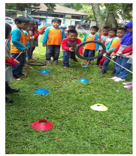
Figure 5. Classroom Cooperation