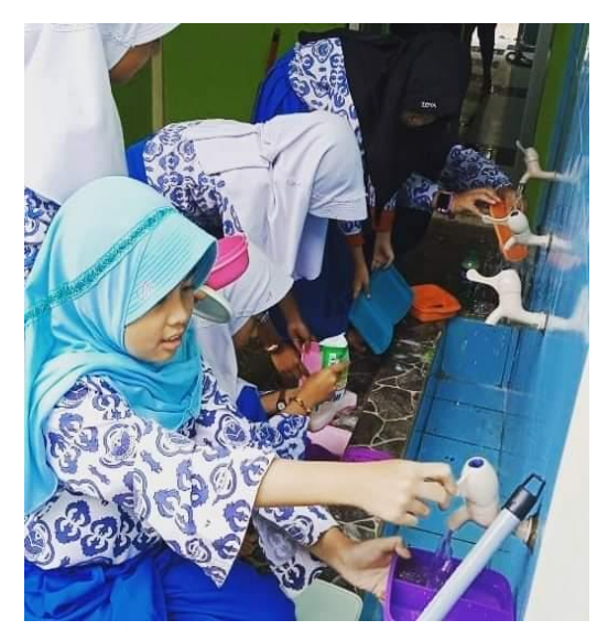
Figure 3. Activities Students

Integrity instilled by students is not only done in schools, but parents at home are also involved in instilling this character. Teachers as parents of students at school work together with parents at home so that good habits that have been taught at school are also instilled at home. This is to build the character's diversity in students so that later what is taught by the teacher in the school carries in everyday life. Parents at home must be committed to the rules and habits taught at school, such as the limit on the use of mobile phones to children every day, good behavior in socializing with others, being good in daily life, and so on.