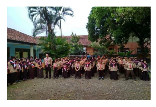
Figure 2. Ceremony Activities

The nationalist character is inculcated to students not only by holding flag ceremonies but on other days. Every student must memorize the Indonesia Raya song and other compulsory songs. Every day, before the implementation of learning, begins students are played a national compulsory song from speakers who deliberately installed by the school in every corner of the school. With this, students are accustomed to listening to national compulsory songs every day so that it makes it easier for students to memorize the lyrics of the song.